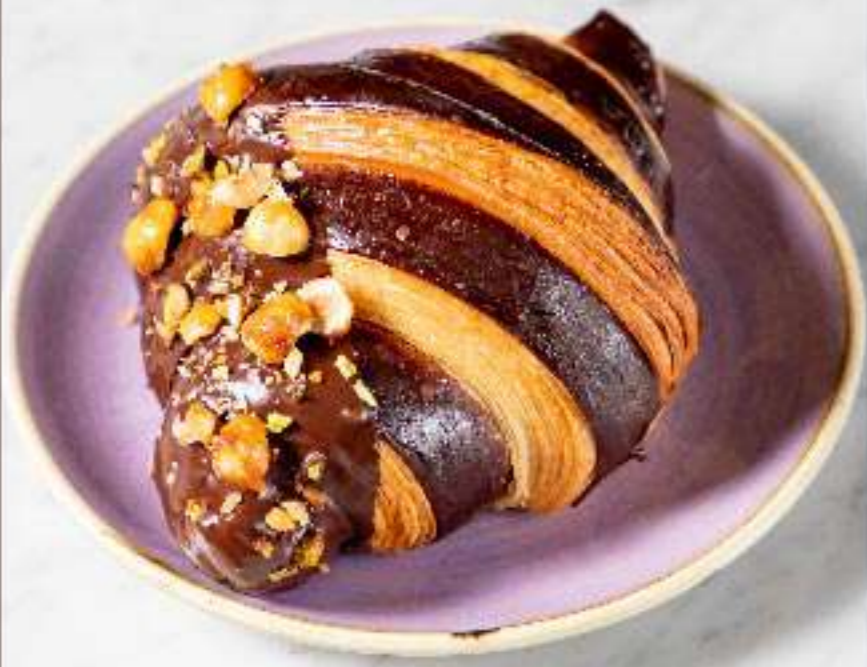
Chocolate Croissant 120฿