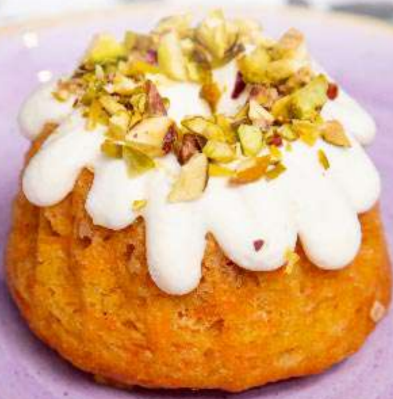
Carrot Cake 80฿