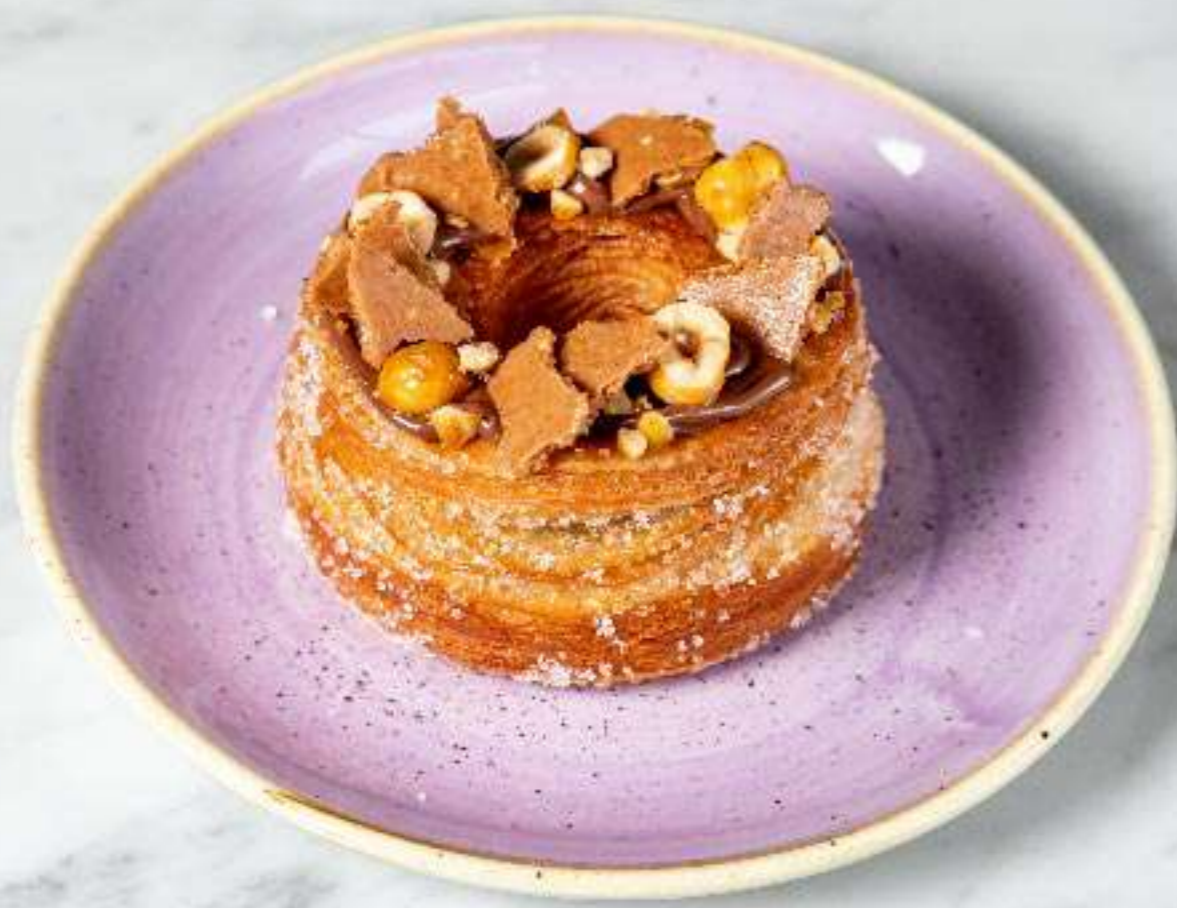
Nutella Cronut 125฿