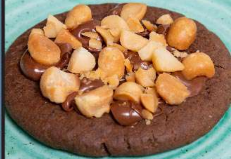
Nutella Double Chocolate Chip Cookie 90฿