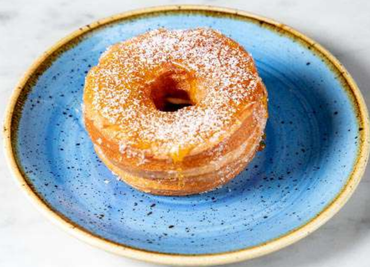
Vanilla Caramel Cronut 125฿