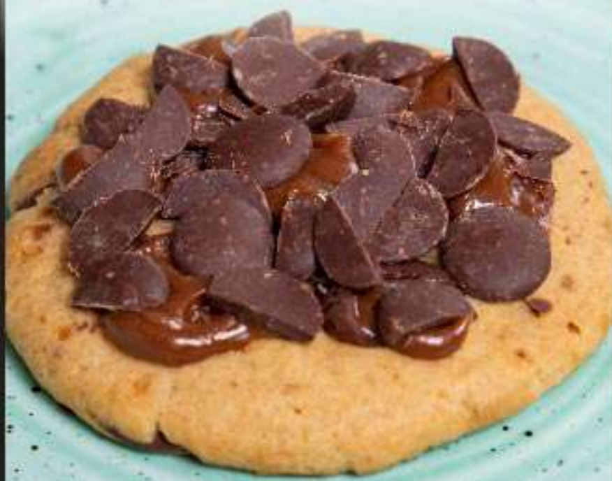
Hazelnut Praline Chocolate Chip Cookie 90฿