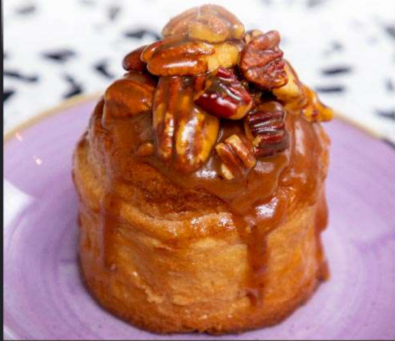
Caramel Mixed Nut Brioche 90฿