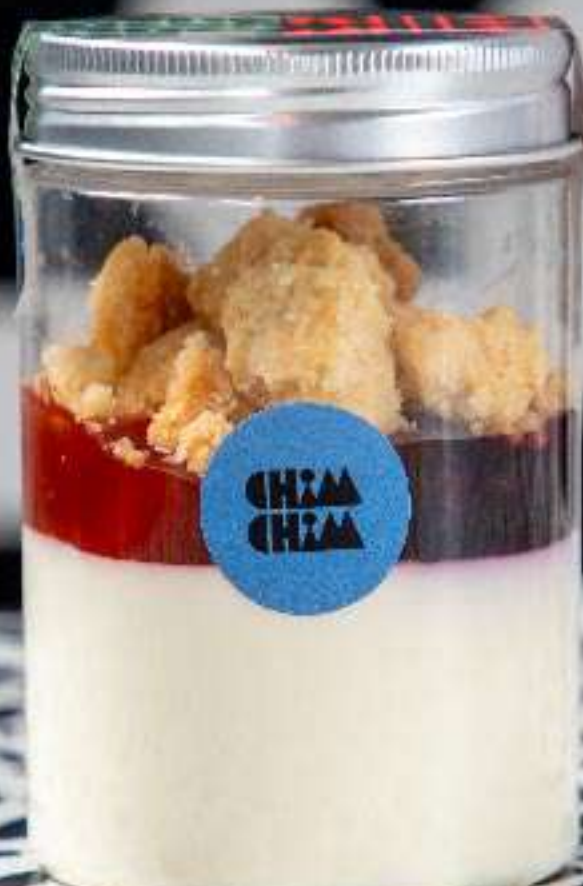
Berry Panna Cotta 160฿