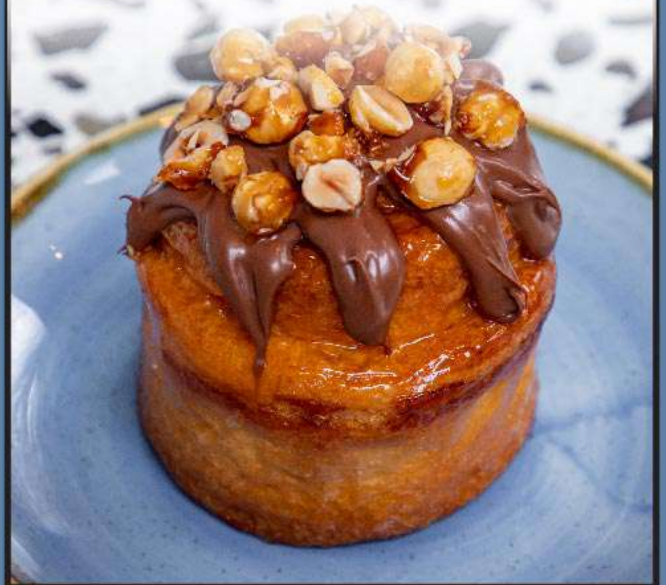
Nutella Brioche 90฿