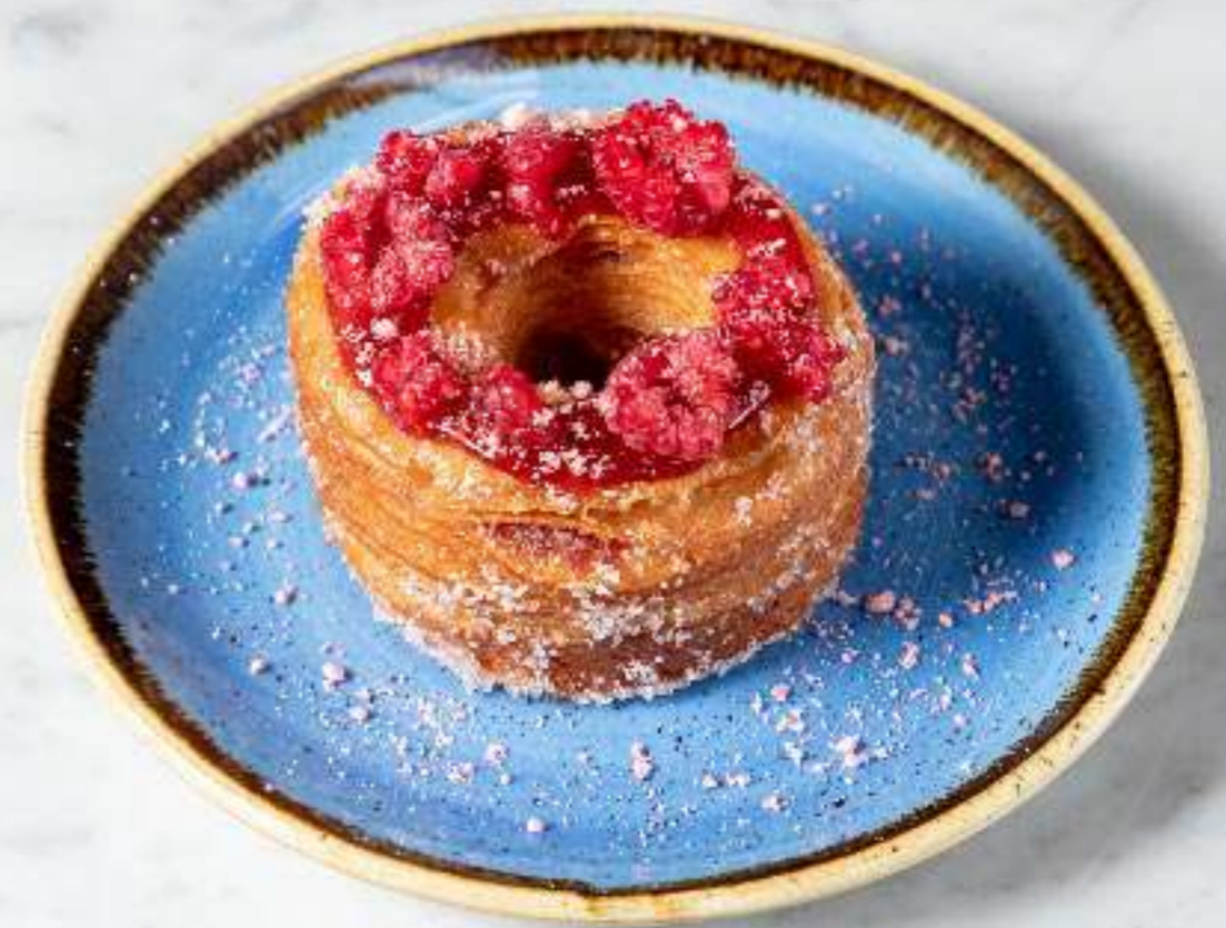
Raspberry & Strawberry Cronut 125฿