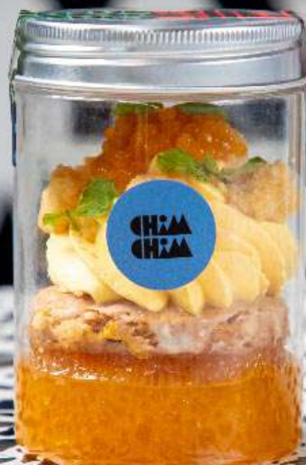
Mango Passion 160฿