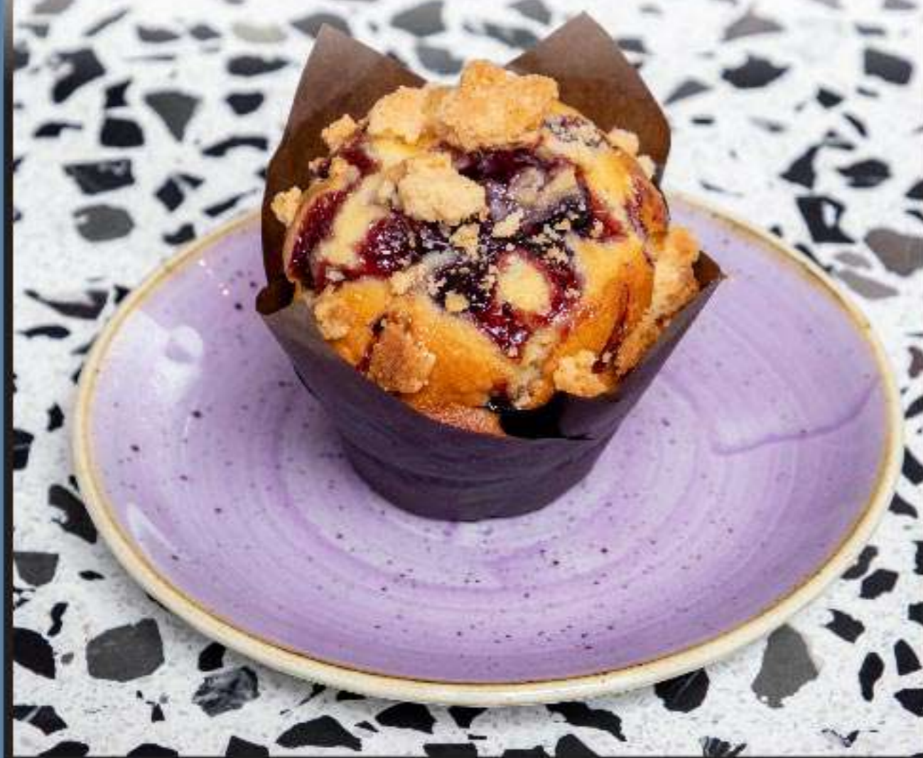
Blueberry Muffin 90฿