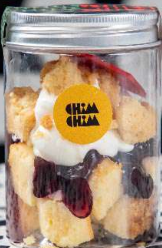
Blueberry Cheese Cake 160฿