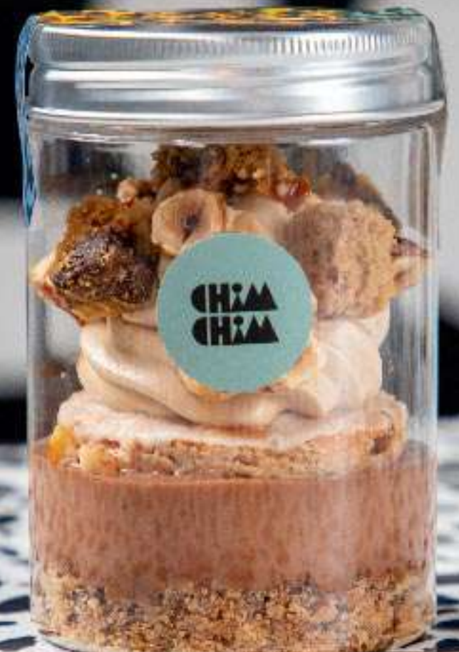
Nutella Chocolate Chip 160฿