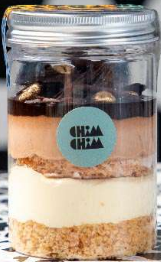
Trio Chocolate 160฿