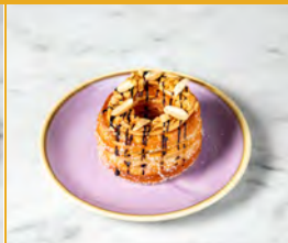
Peanut Butter Cronut