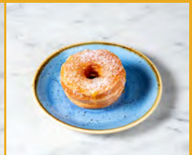
Vanilla Caramel Cronut