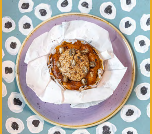
Mocha Burnt Cheesecake