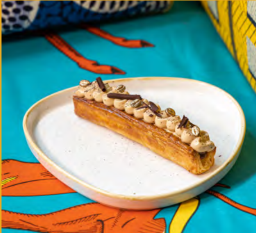
Finger Croissant Tiramisu