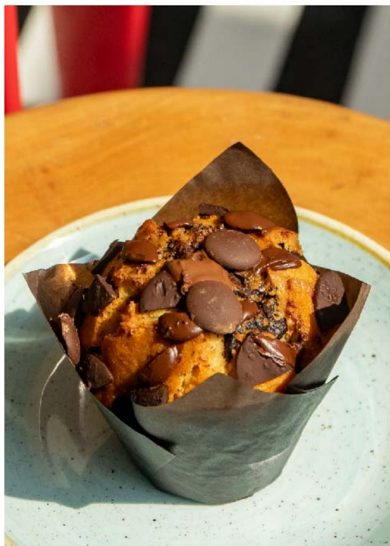
Nutella Chocolate Chip Muffin 95¢