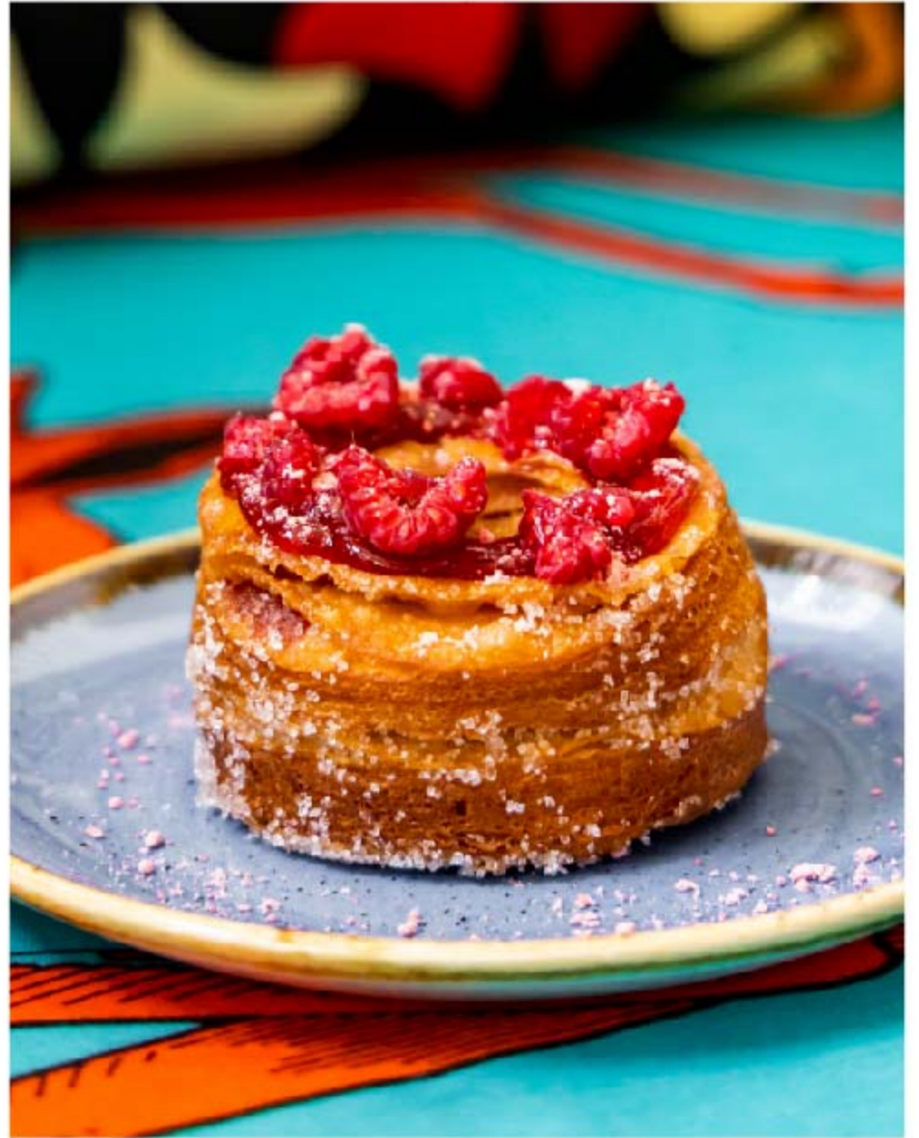
Raspberry & Strawberry Cronut