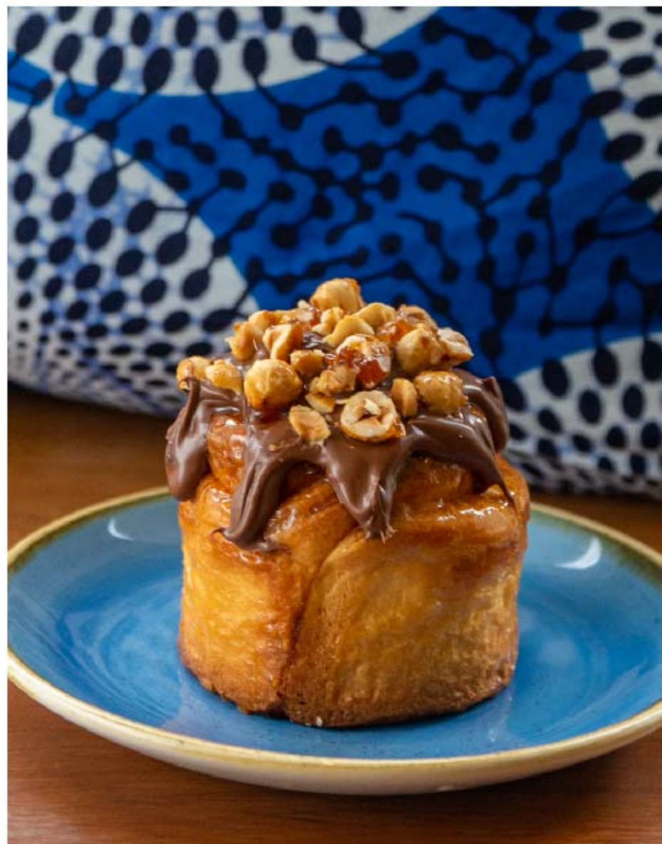
Nutella Brioche 95¢