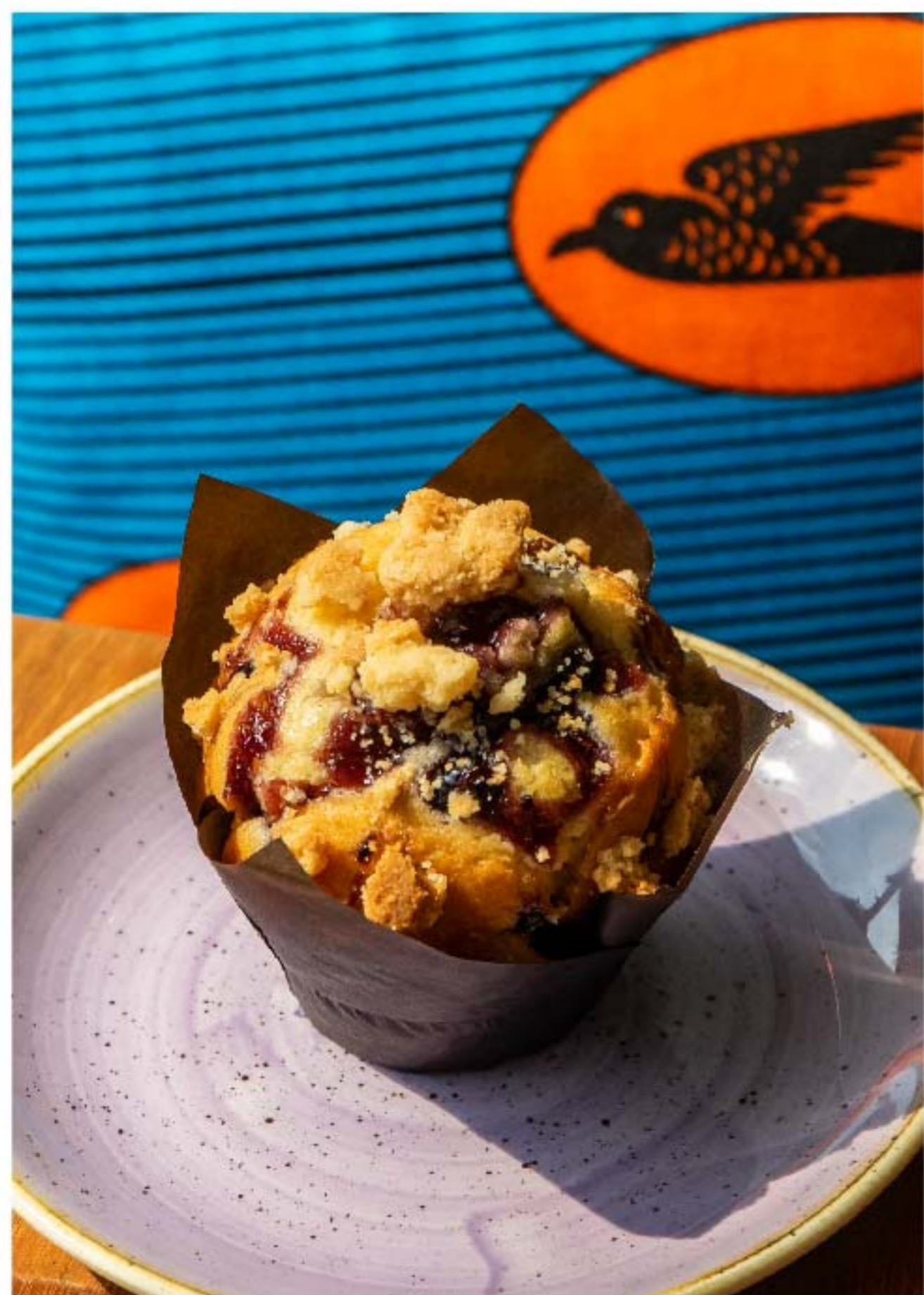
Blueberry Muffin 95¢