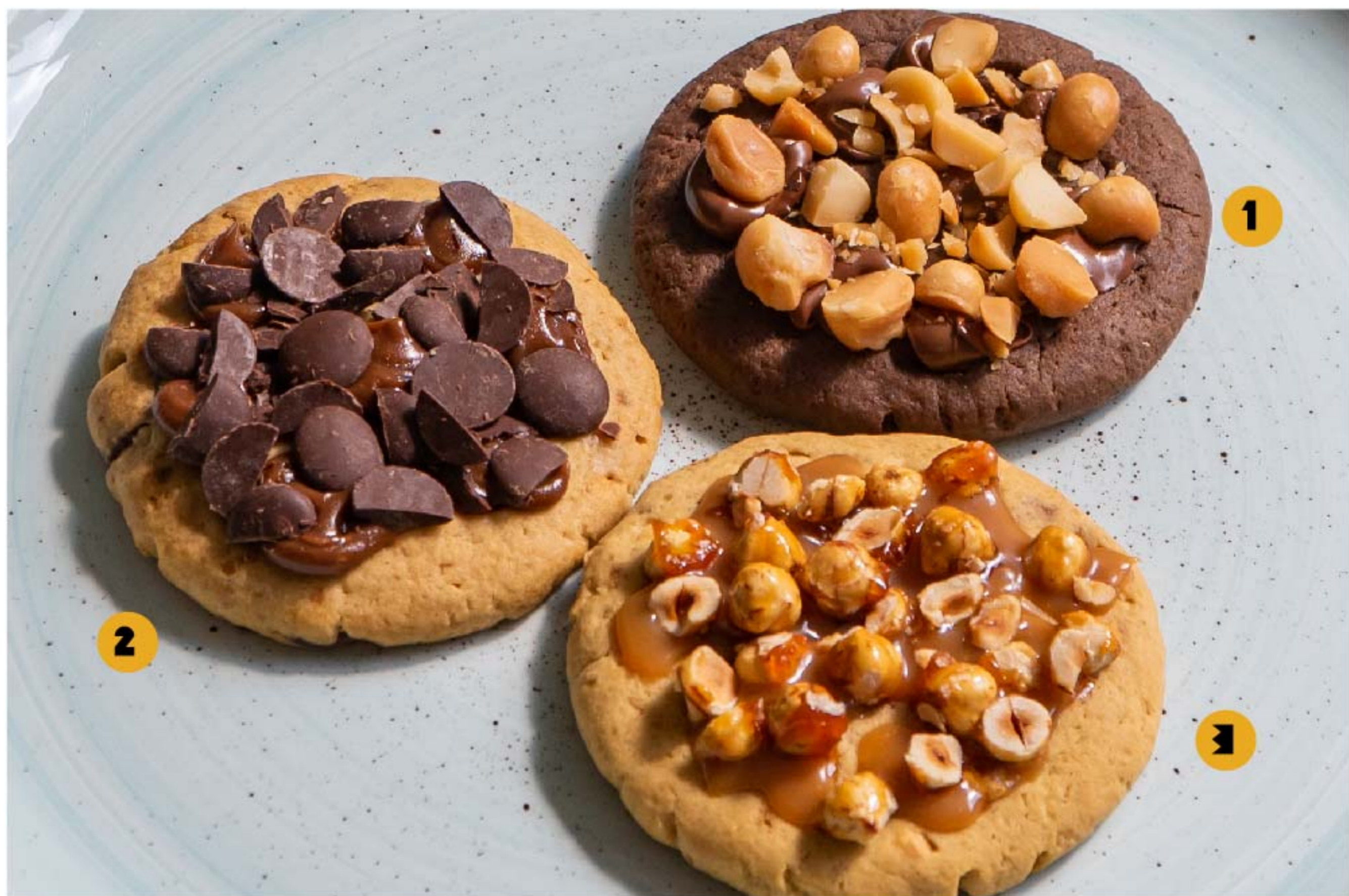
1. Nutella Double Chocolate Chip Cookie