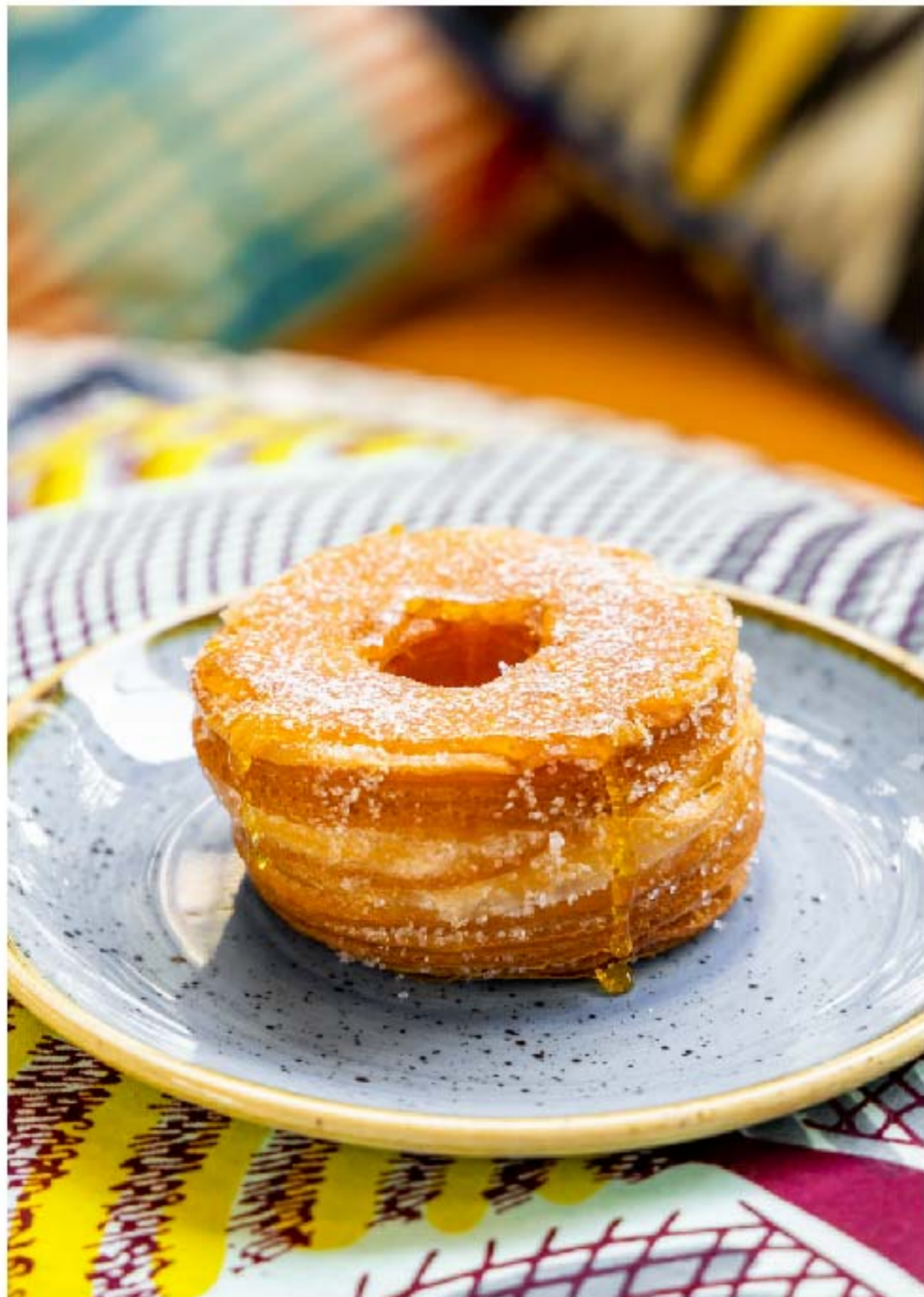
Vanilla Caramel Cronut