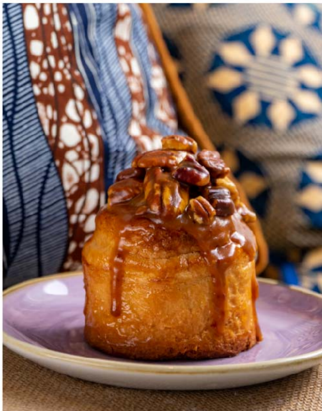
Caramel Mixed Nut Brioche 95¢