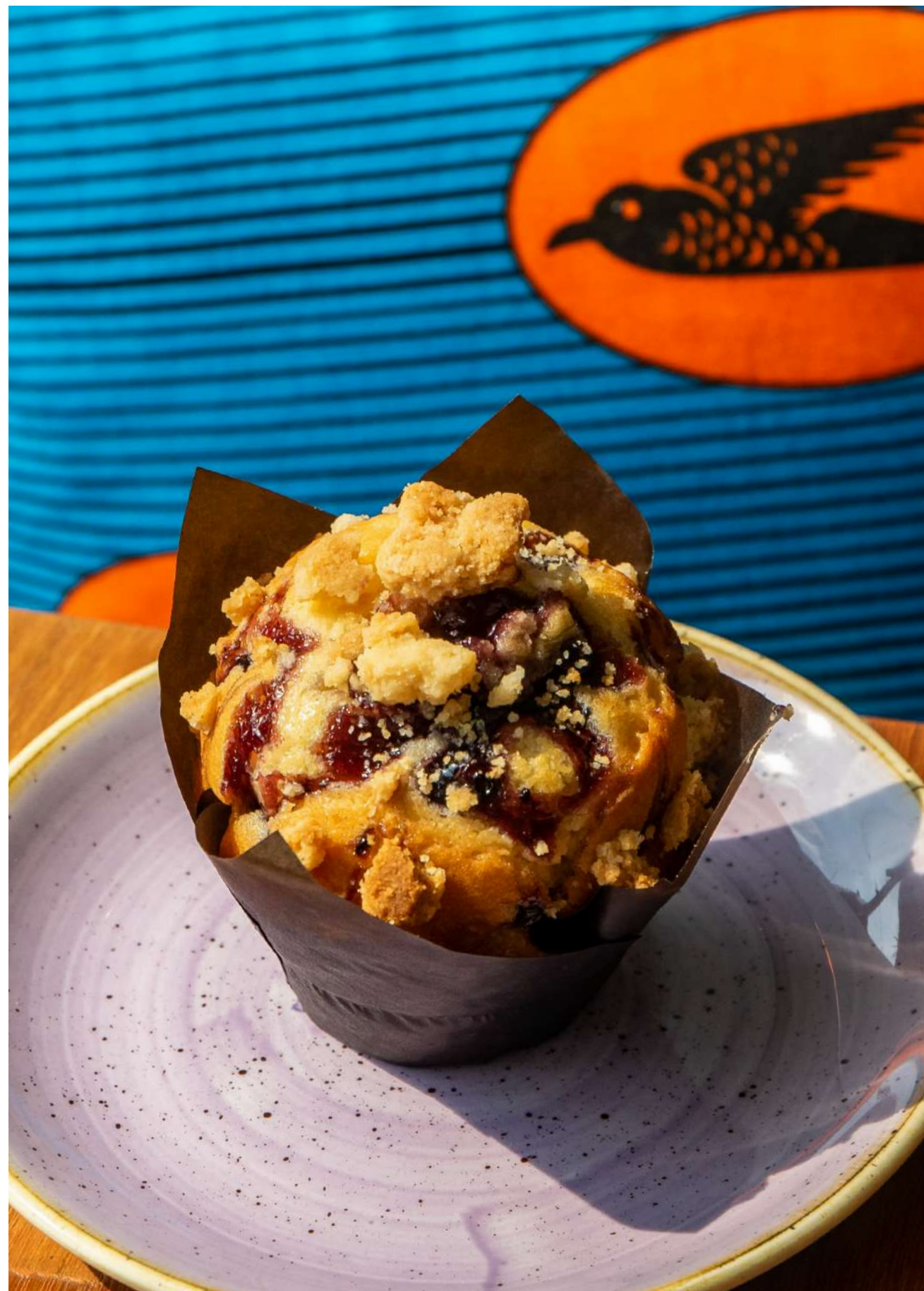
Blueberry Muffin 90฿