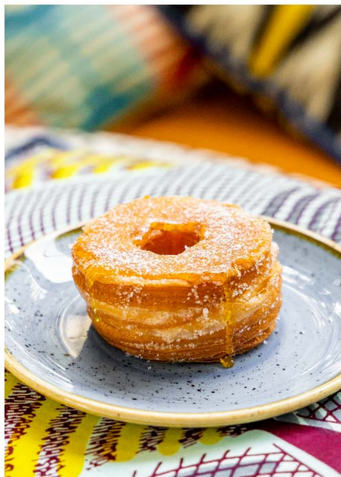
Vanilla Caramel Cronut