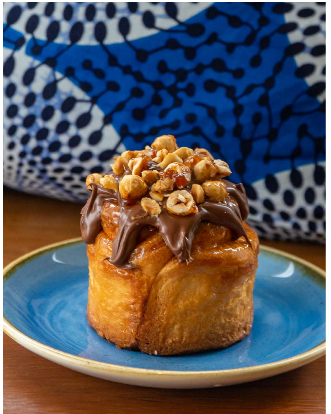
Nutella Brioche 90฿