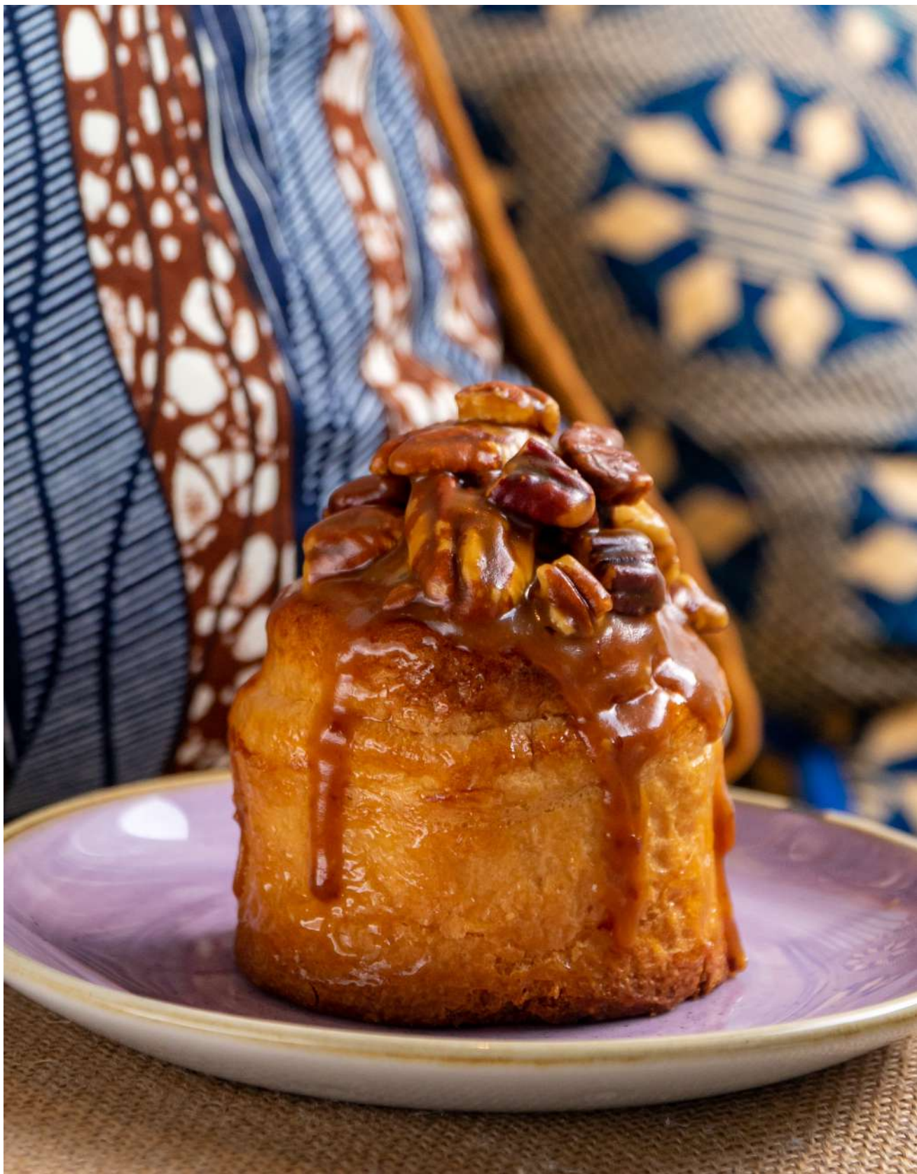
Caramel Mixed Nut Brioche 90฿