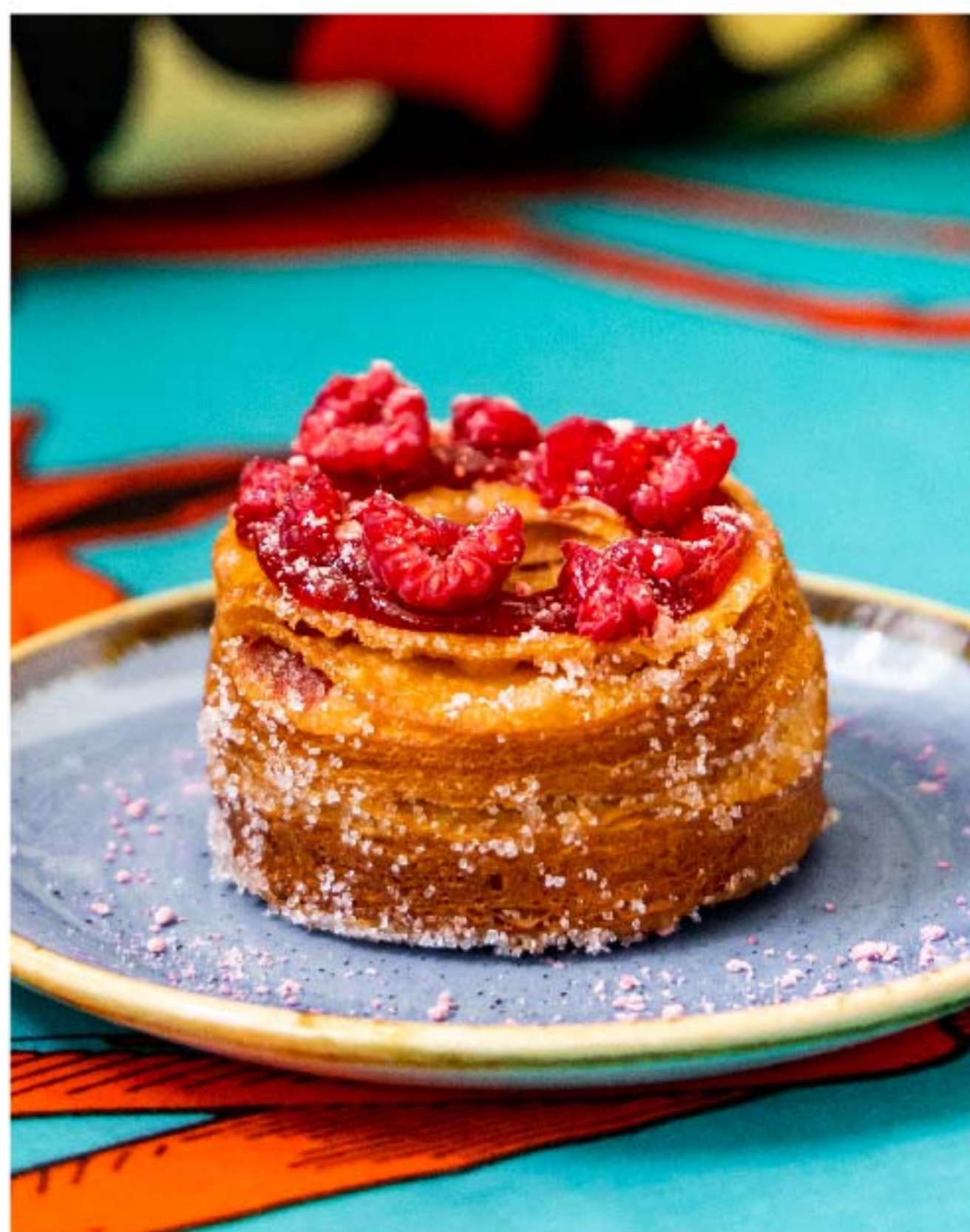
Raspberry & Strawberry Cronut