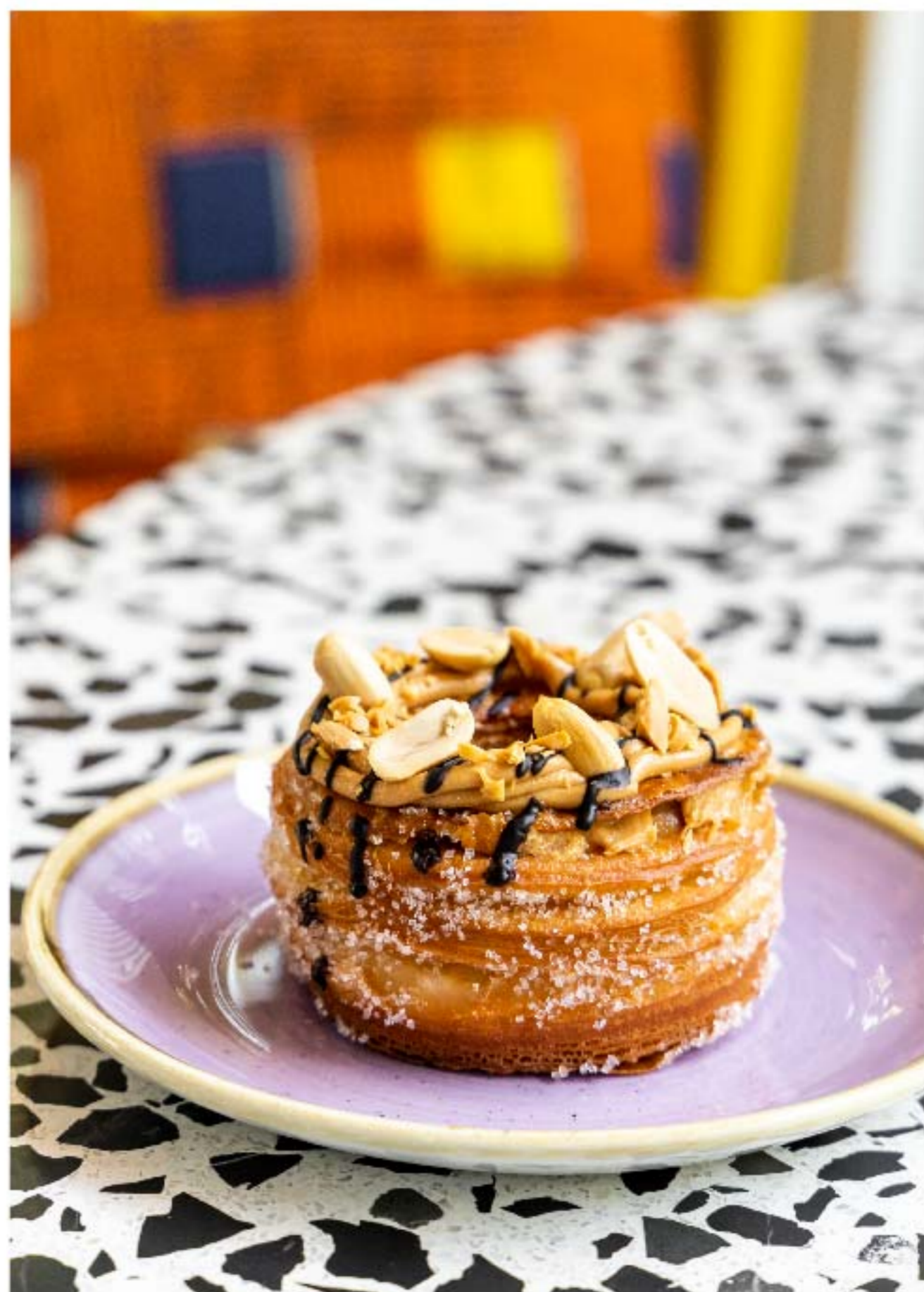
Peanut Butter Cronut