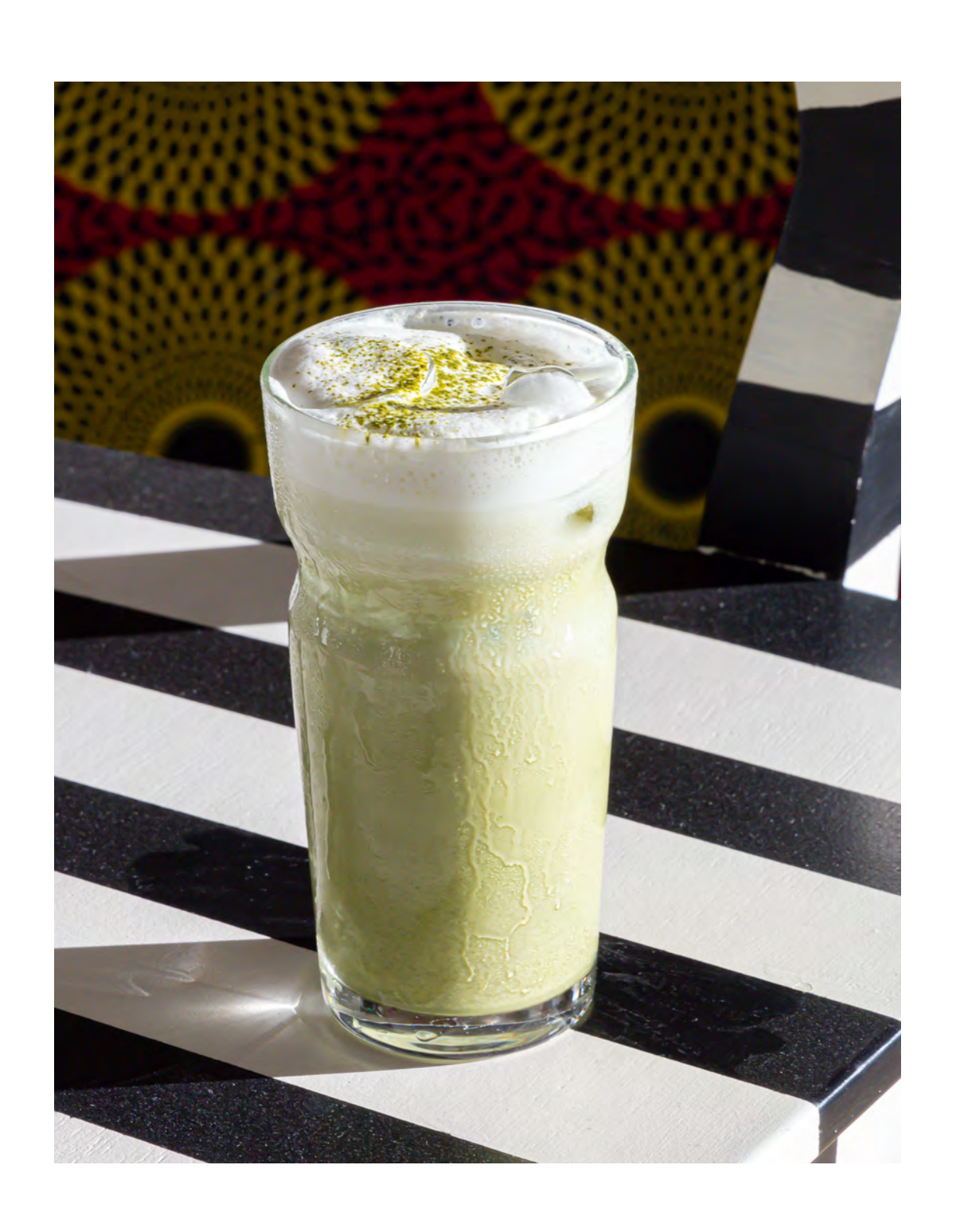
Iced Matcha Latte 1208 Matcha Green tea, Milk