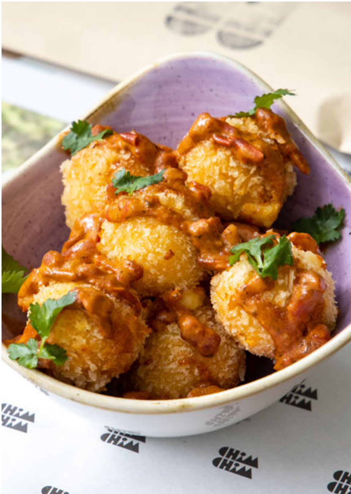
Corn Croquette Croquettes of Potato, Sweet Corn Kernel, Cheese, Topped with Tomato Masala, Mayonnaise 220฿