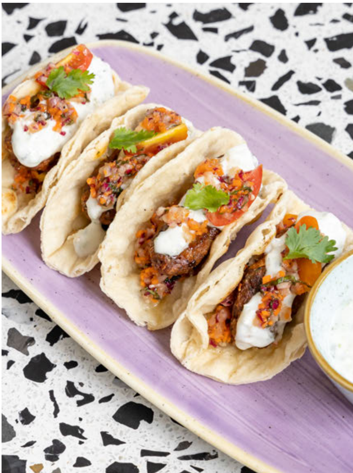
Vegan Kefta Wrap Vegan Kefta Balls, Carrot, Onion, and Radicchio in Onion Dressing, Yoghurt Sauce, Homemade Soft Wrap 390฿