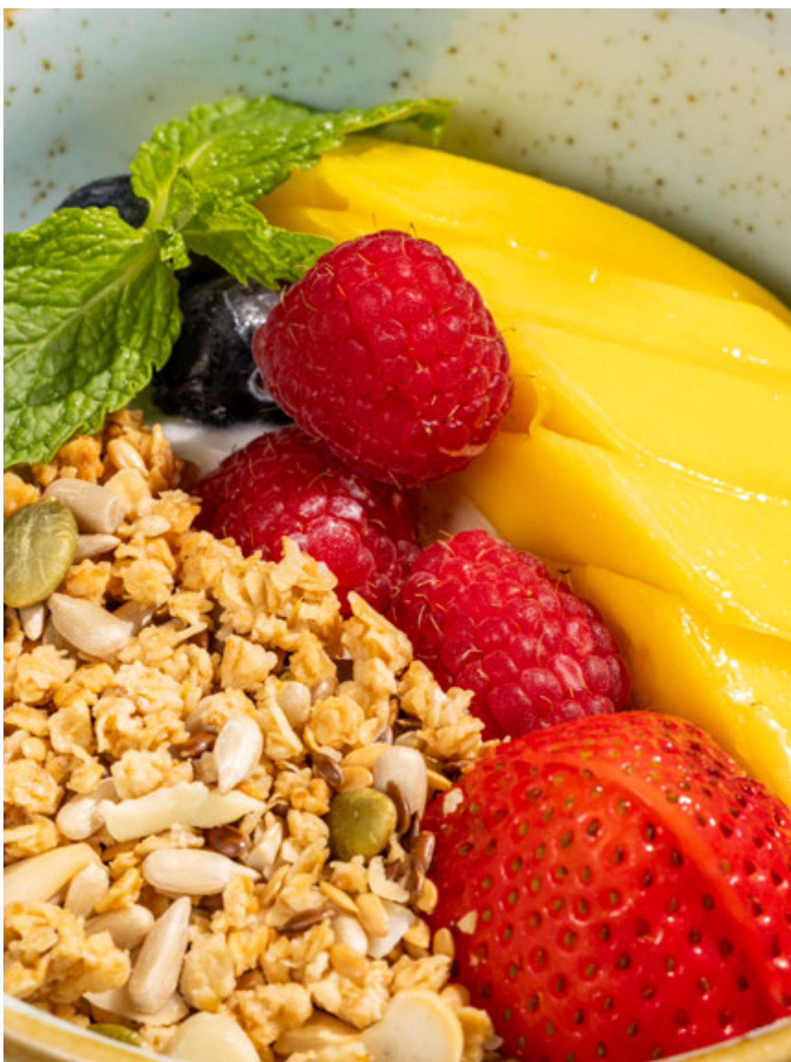
Coconut Chia Pudding Mango, Coconut Yogurt, Granola, Nuts & Seeds 380฿

Prices are Subject to 7% VAT and 10% Service Charge