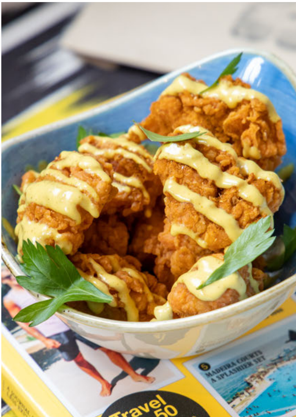
Chicken Pop Seasoned Deep Fried Chicken Pop 199฿