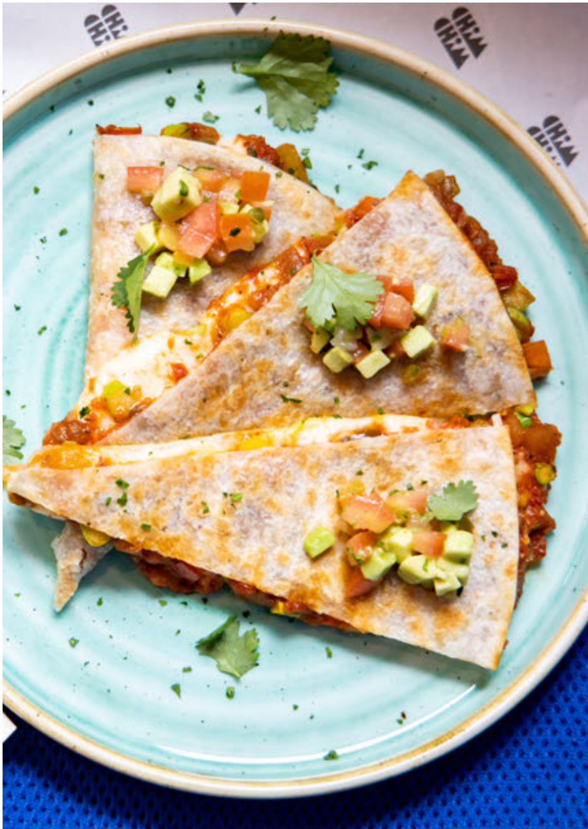
Veggie Quesadillas Mozzarella, Celery, Onion, Purple Eggplant, Carrot, Asparagus, Diced Tomato