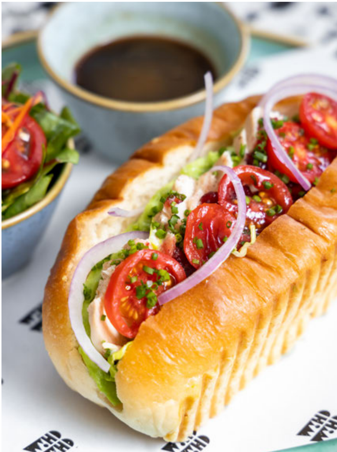
Chicken Cranberry Roll Brined Chicken Breast, Sliced Avocado, Dill and Mayo, Spring Onion, "Abondance" Cheese, Cranberry Sauce, Shallot, Homemade Shokupan Roll Served with Chicken Jus and Mixed Salad 370฿