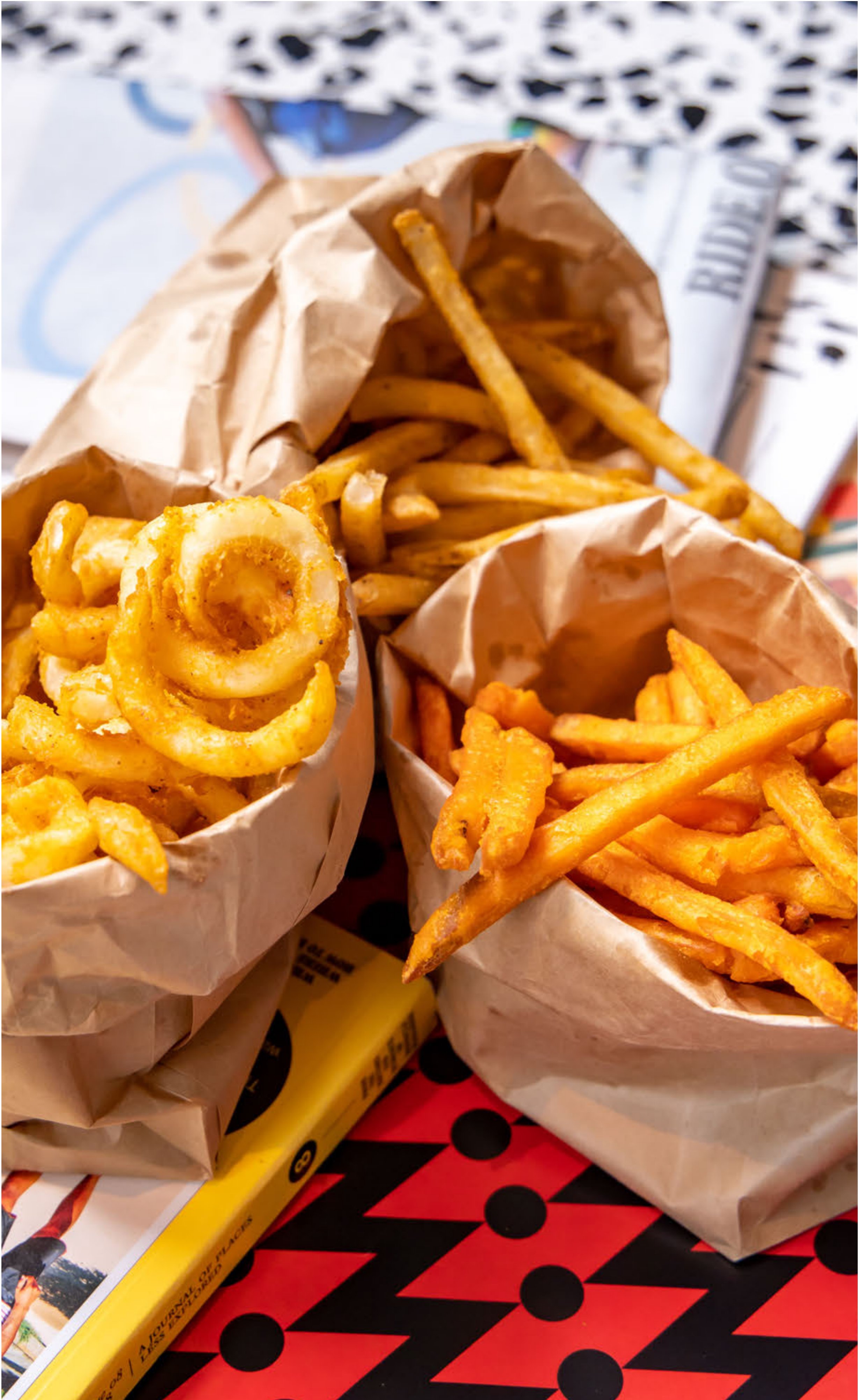
Shake’ Em Fries Sweet Potato Fries, Cajun Fries, Curly Fries