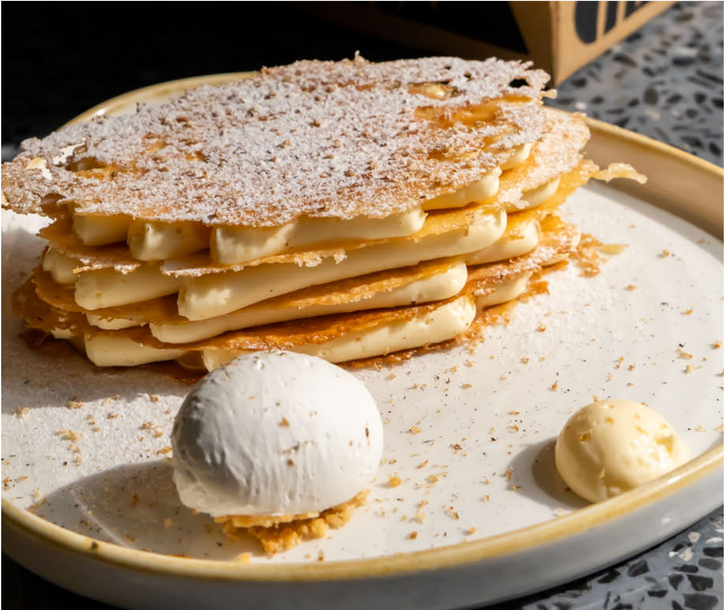
Vanilla Millefeuille Mille Feuille Puff, Vanilla Cream, Miso Caramel, Tonka Ice Cream, White Crumble, Vanilla Icing, Sliced Tonka Bean 290฿