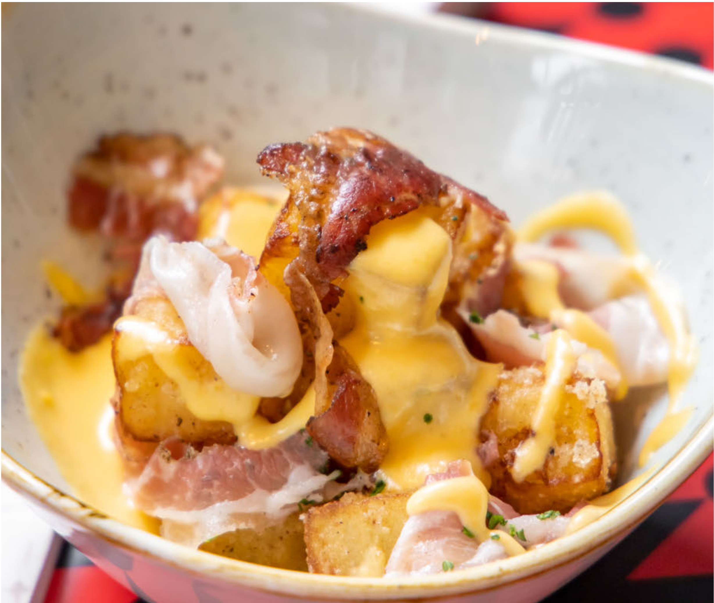
Crispy Roasted Potato with Cheese & Pancetta Sauteed Potato with Pancetta Served with Cheese Sauce 190฿