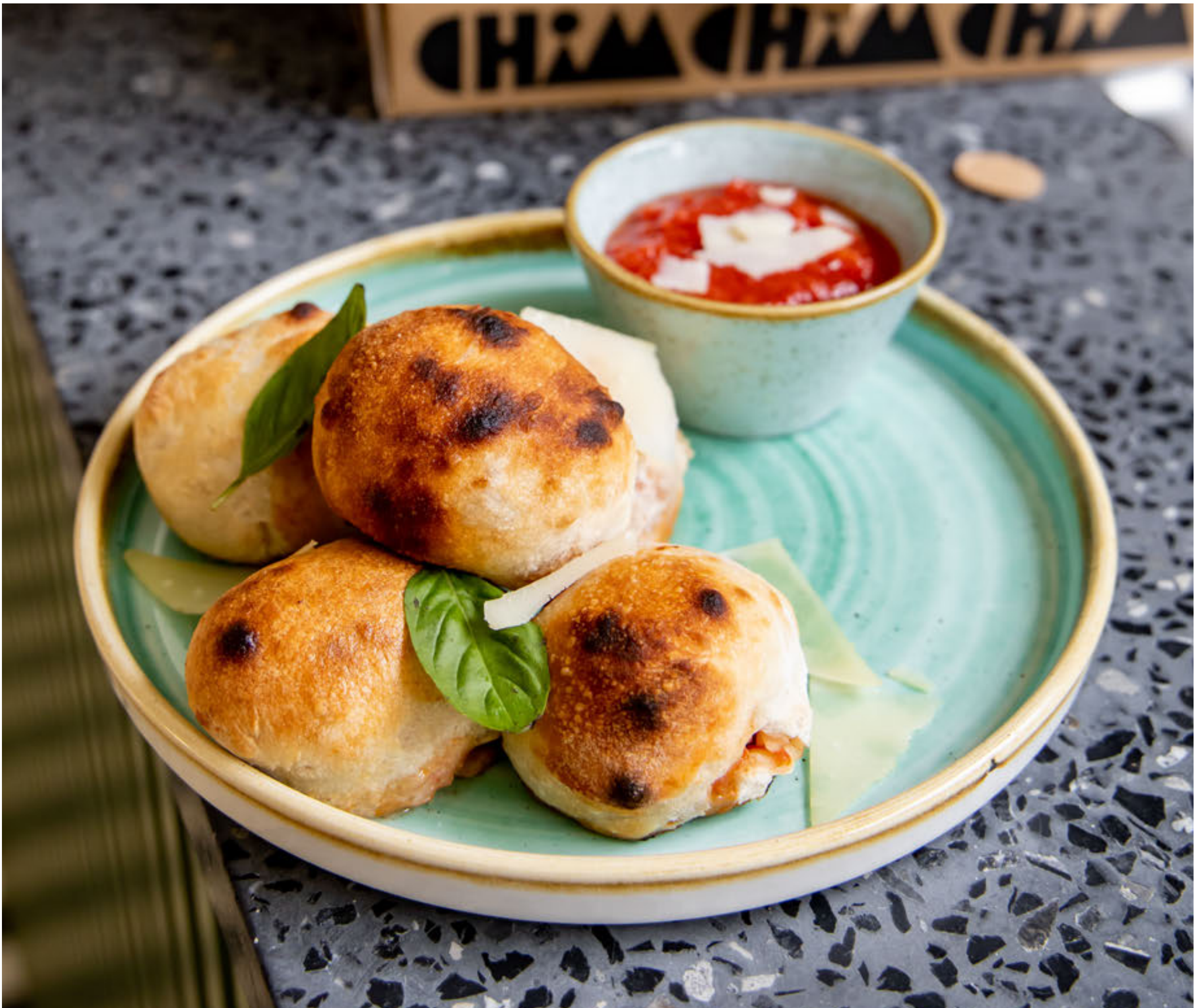
Pizza Bomb Pulled Pork Barbecue