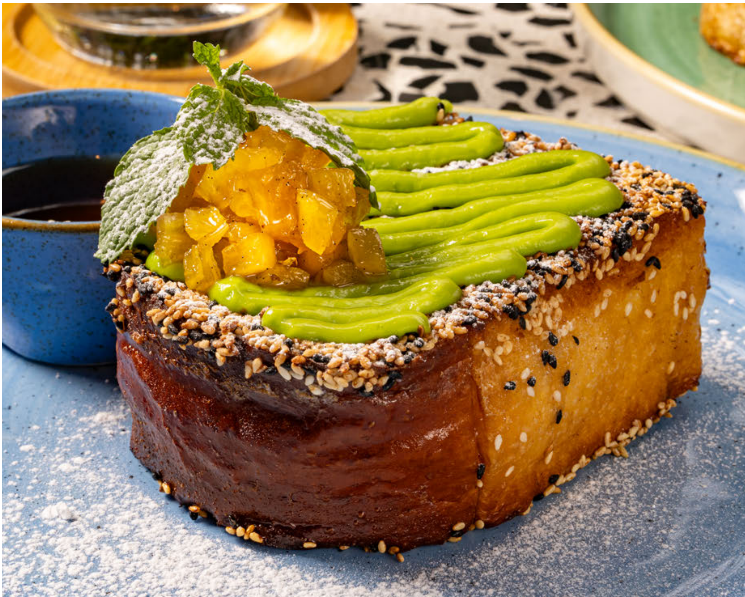
French Toast Kaya Custard, Pineapple, Sesame Seeds, Maple Syrup 350฿