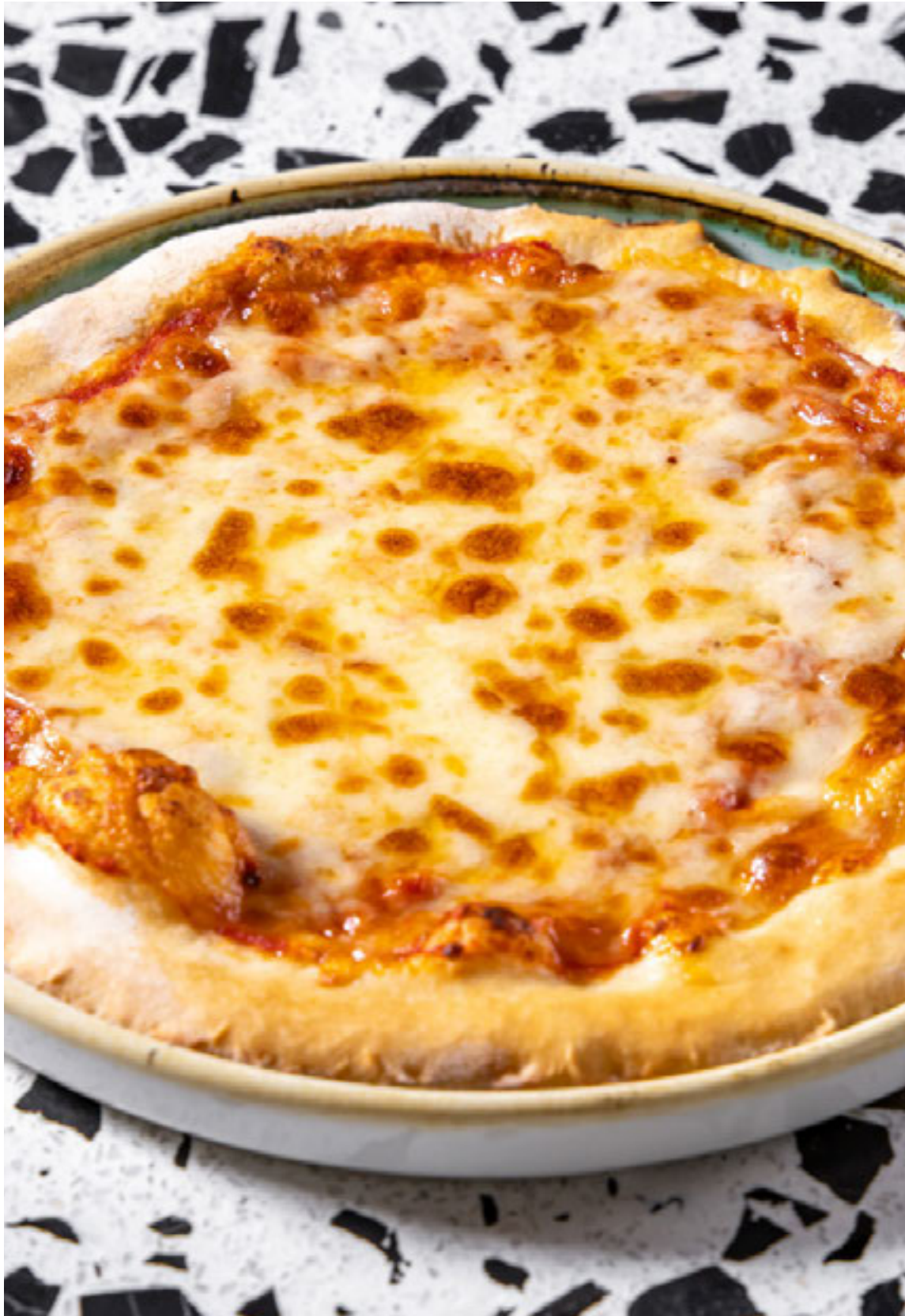
Margherita Pizza Mozzarella Cheese, Tomato Sauce 190฿