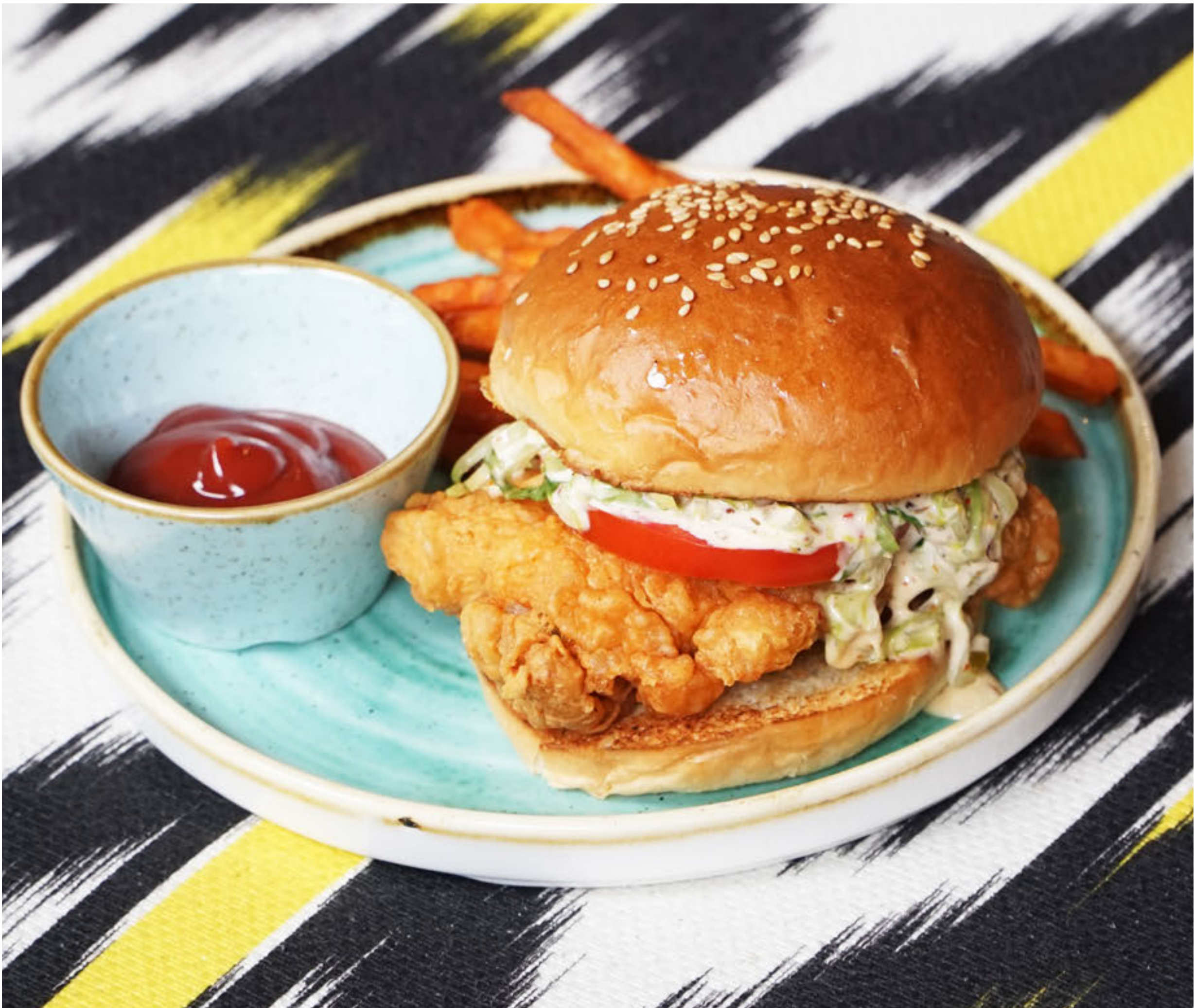
Chicken Zing Zing Burger Crispy and Juicy Brined Chicken, Tomato, Cheddar, Homemade Tangy Slaw, Pickled Jalapenos, Pickles, Homemade Burger Bun Served with Sweet Potato Fries 370฿