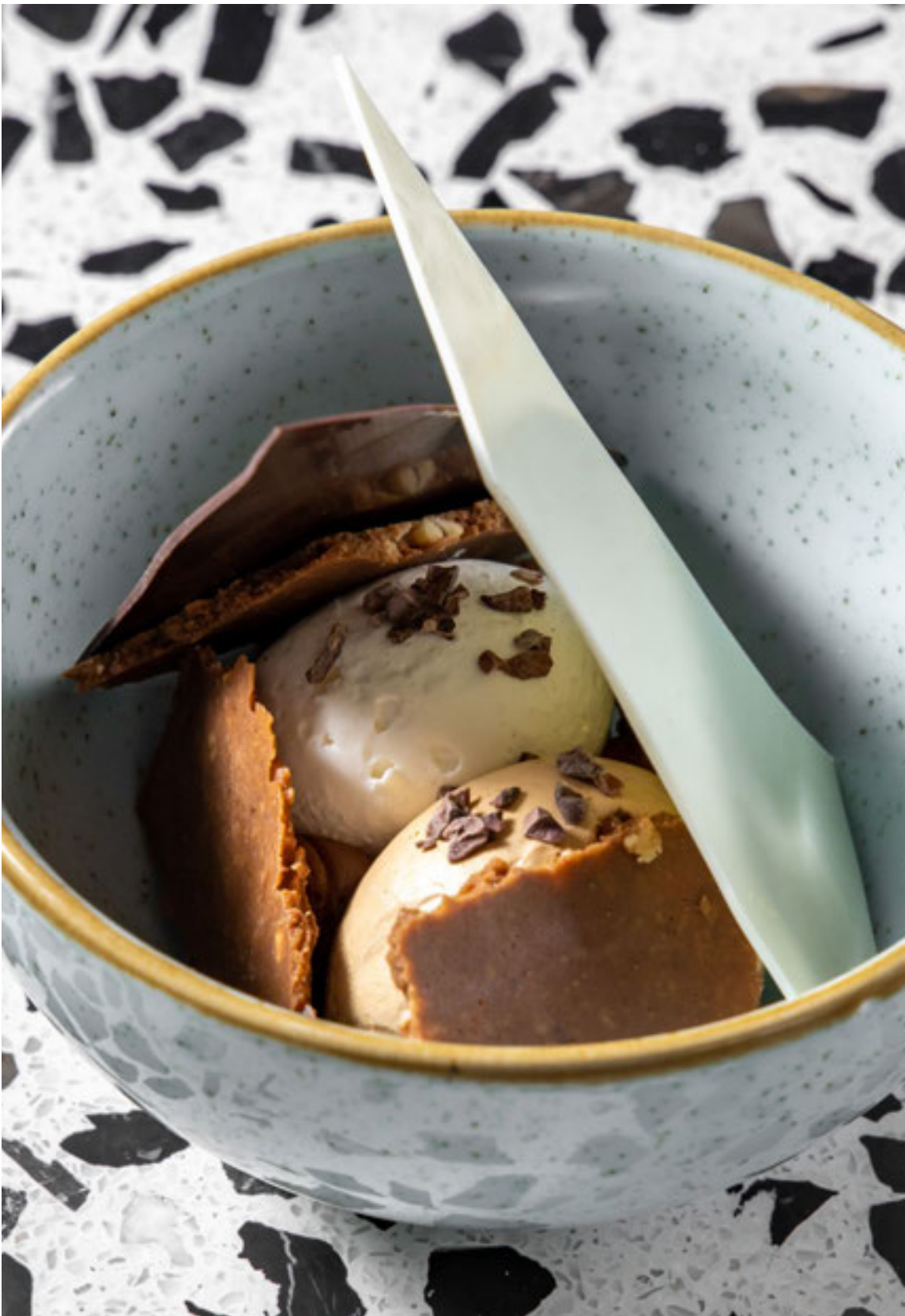
Coco-Nut 290฿ Chocolate Hazelnut Cake with Cacao Nibs, Praline Cream, Hazelnut Ice Cream, Chocolate Feuilletine, Coconut Sorbet, Cracked Dark Chocolate, White Chocolate Sheets