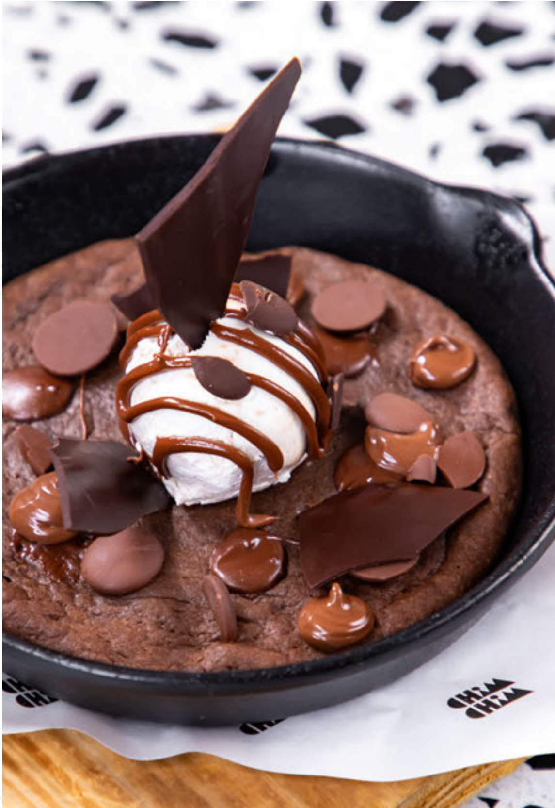
Double Chocolate Chip Cookies 270฿ Vanilla Brownie Ice Cream, Cracked Chocolate Sheets, Chopped Dark Chocolate, Nutella Sauce