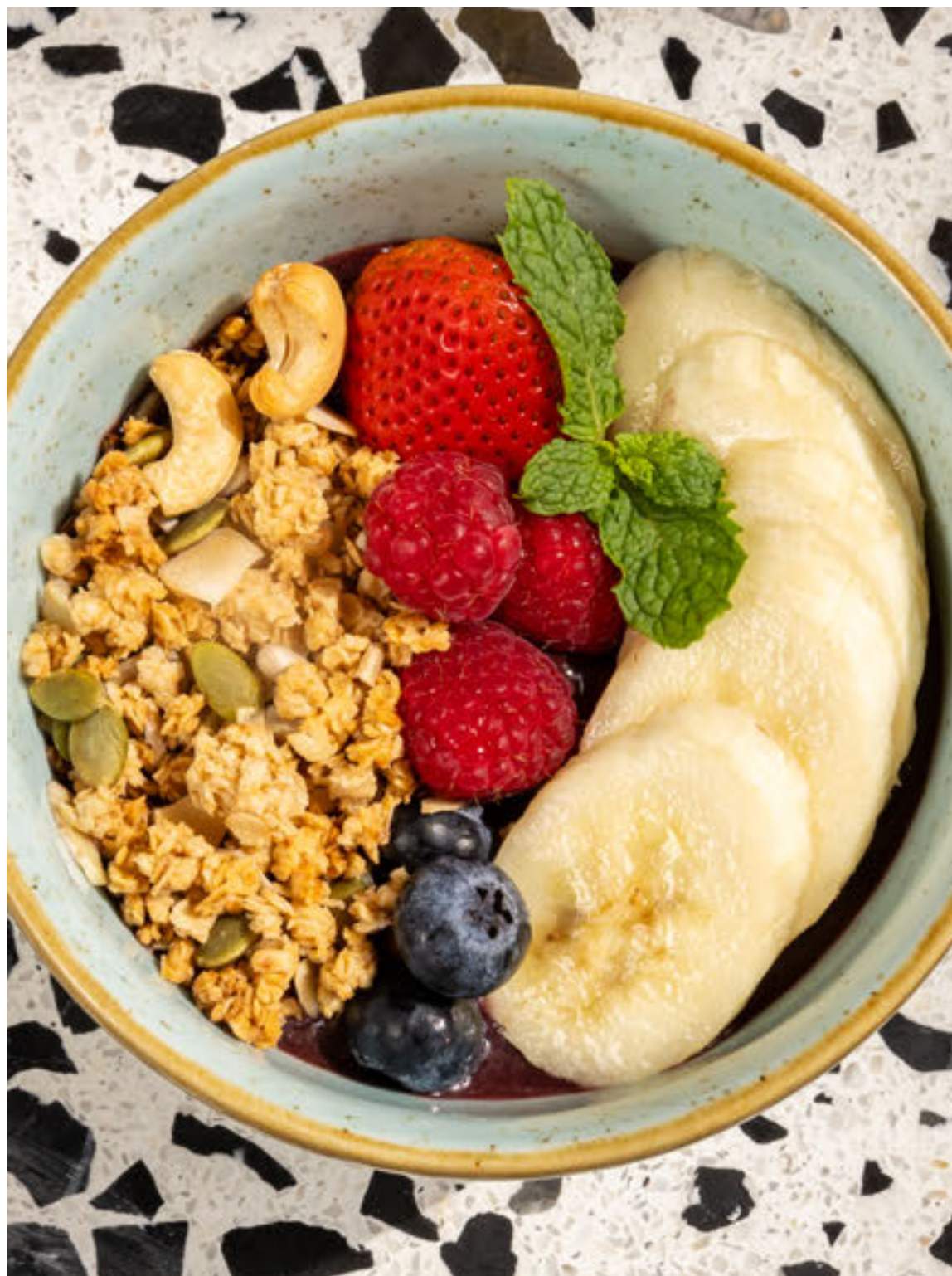
Açaí Bowl Açaí, Banana, Berries, Granola, Nuts + Seeds 380฿