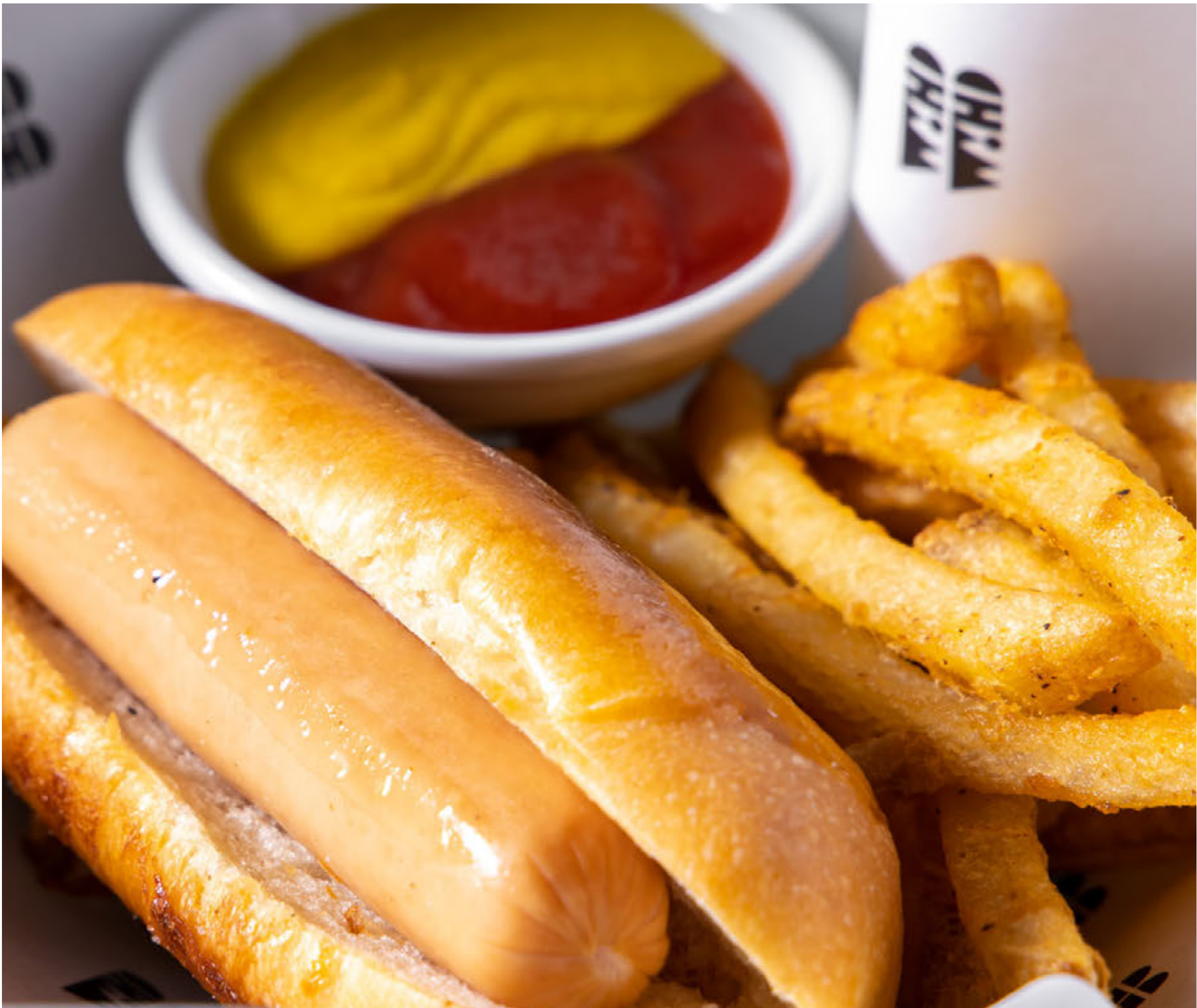
Chicken Hot Dog Hot Dog, Cajun Fries, Mustard & Ketchup 190฿