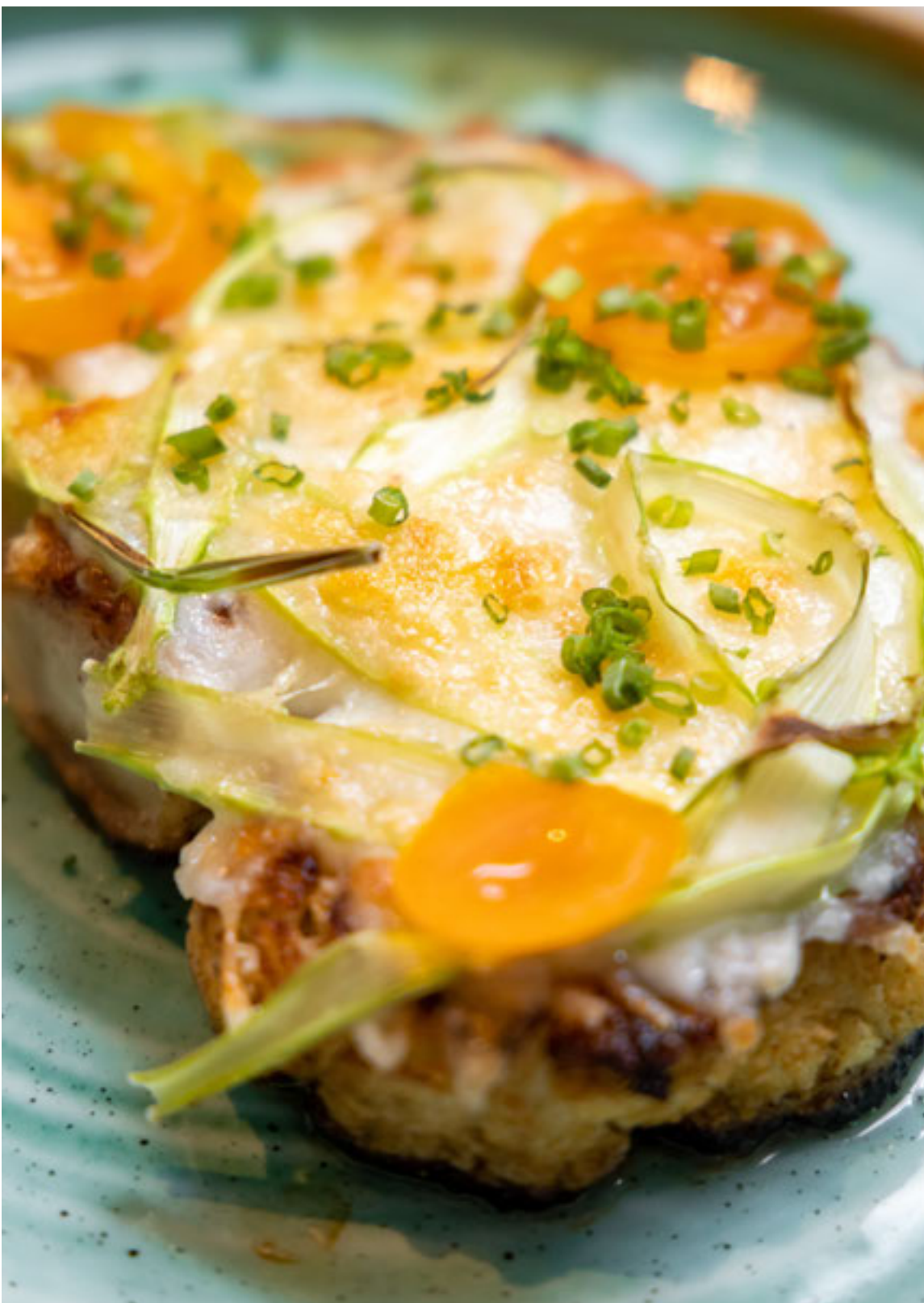
Baked Cheesy Cauliflower Spicy Seasoned Cauliflower, Mozzarella Cheese, Parmesan Cheese