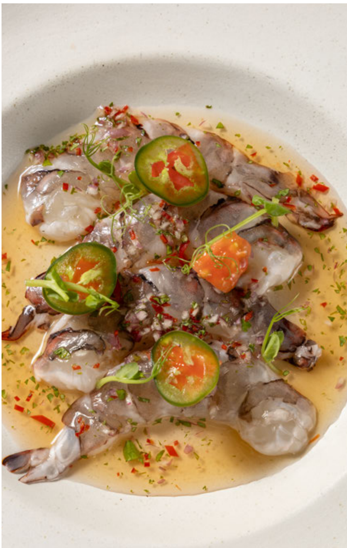
Chim Ceviche Tiger Prawns, Jalapeño, Lime, Red Chili 550฿