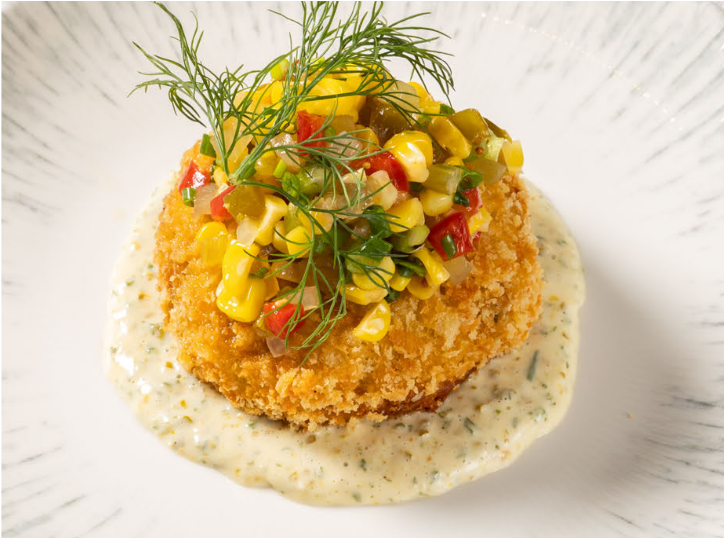
Crab Cakes Corn Relish, Pepperoncini Aioli 395฿