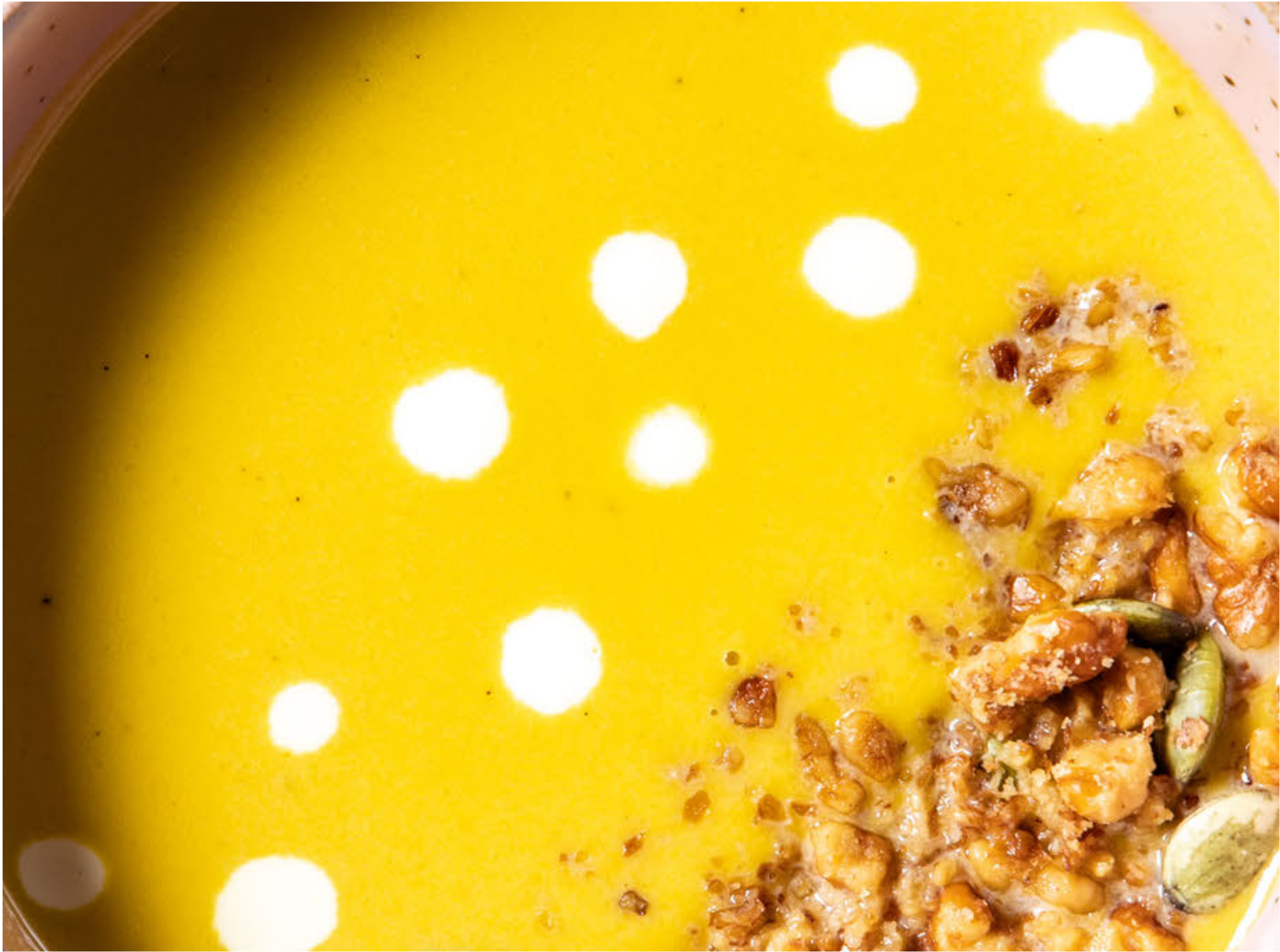
Pumpkin Soup Roasted Pumpkin with Walnuts and Cream 220฿