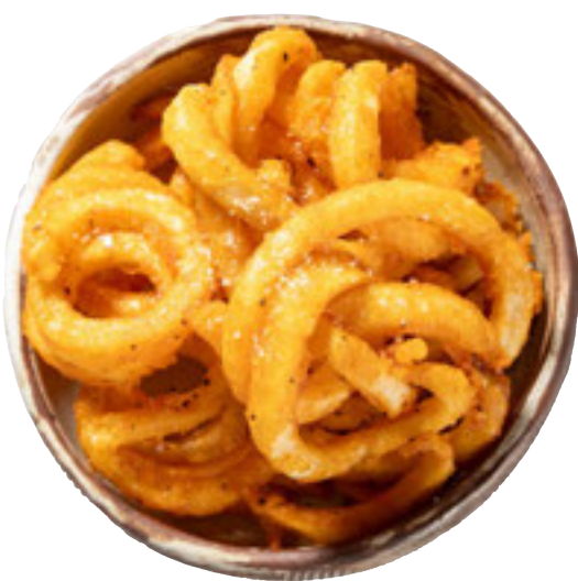
Curly Fries with Truffle Salt