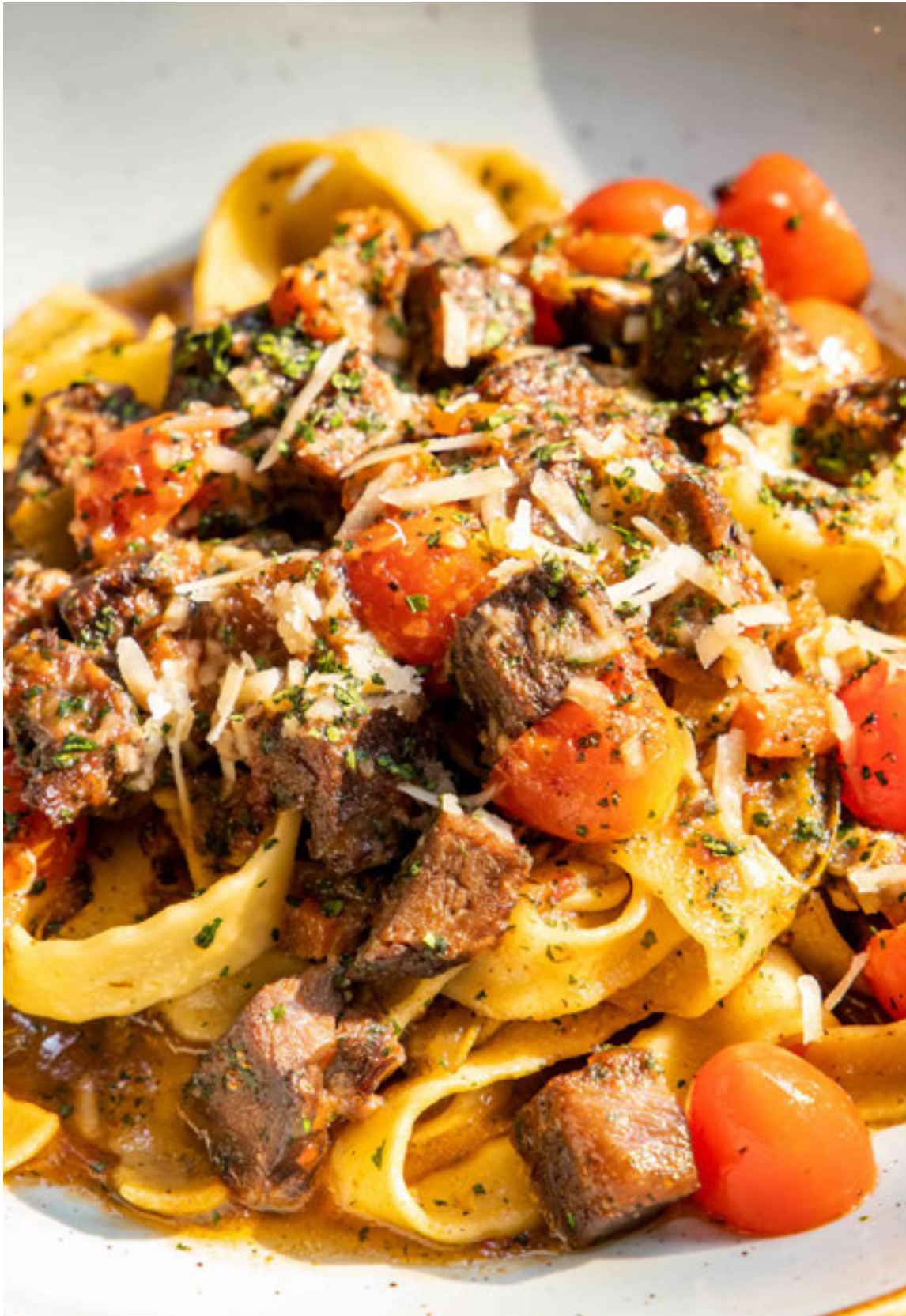
Beef Shank Pappardelle Braised Beef Shank with Red Wine, Tomato, Chopped Parsley, Grated Parmesan Cheese 420฿