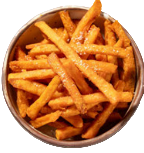
Sweet Potato Fries