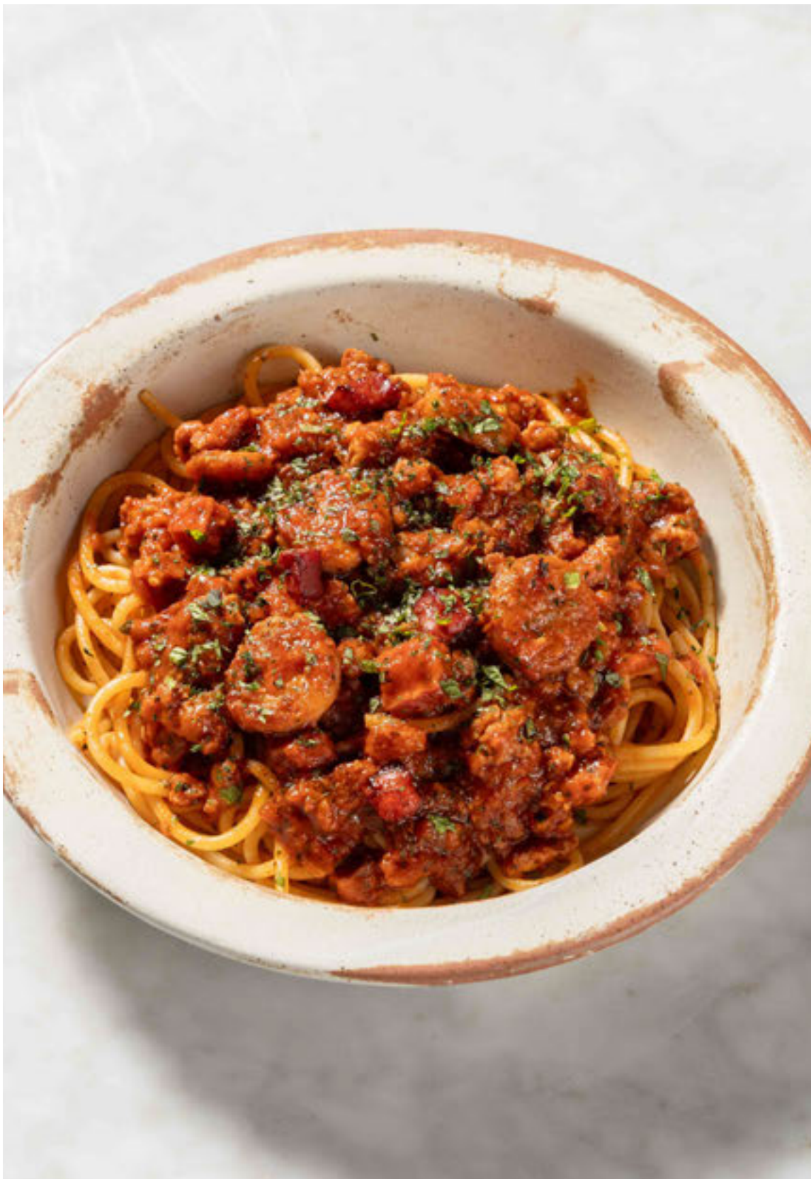
Sausage & Chorizo Spaghetti Fresh Fennel Sausage, Spicy Chorizo, Paprika 400฿