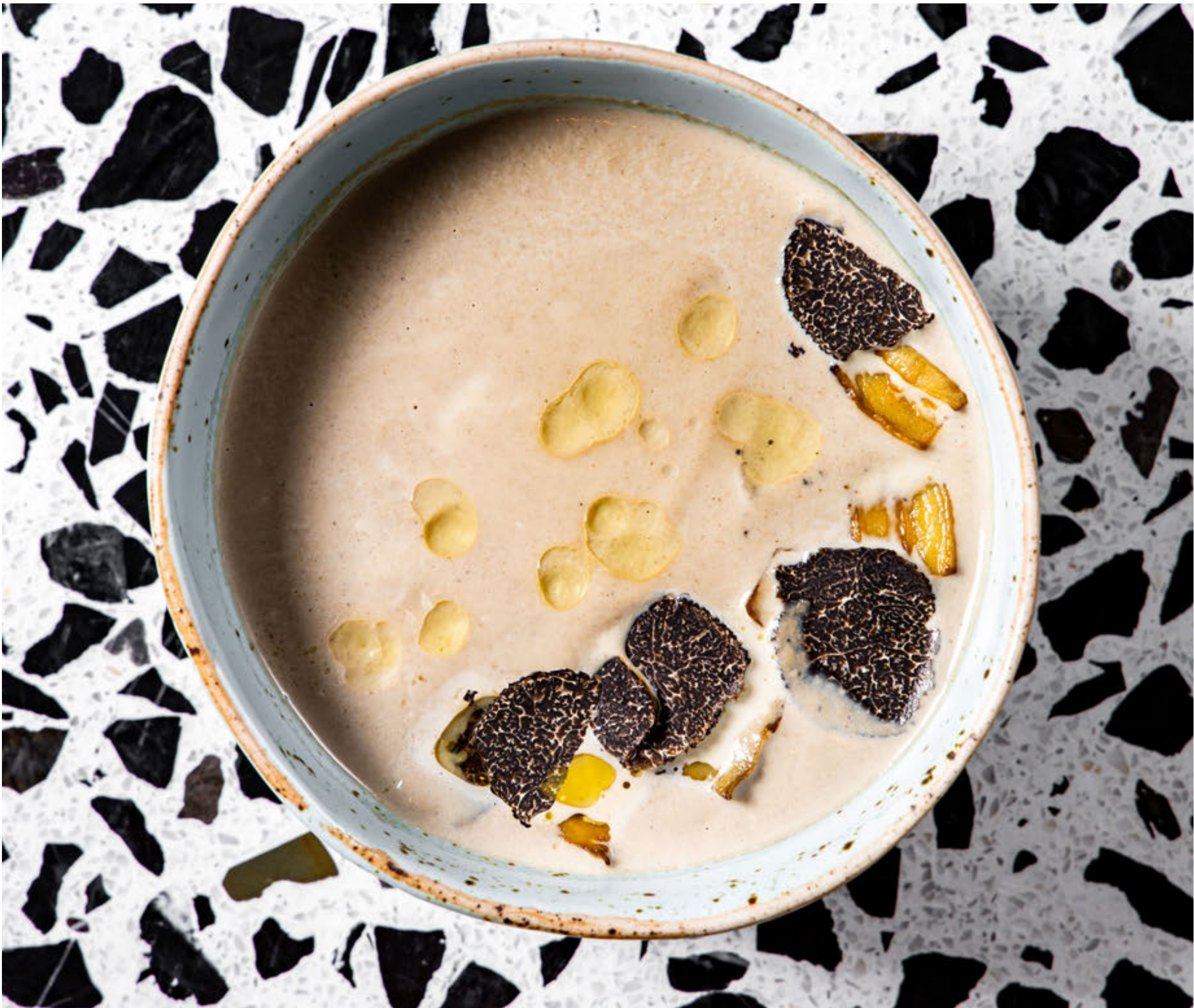
Mushroom Soup Champignon Mushroom Soup with Mushroom Chips, Truffle Oil 370฿