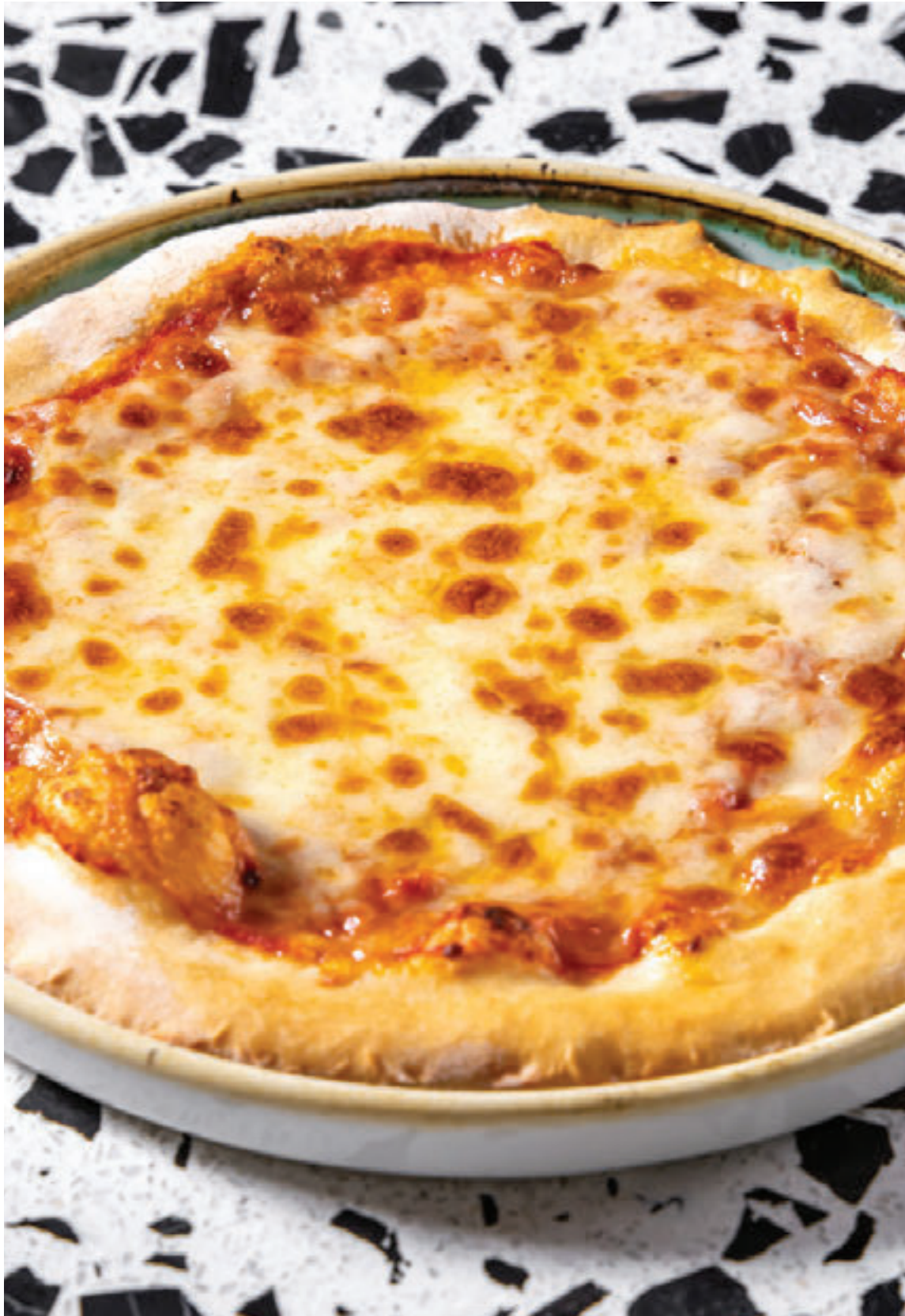
Margherita Pizza Mozzarella Cheese, Tomato Sauce 190฿