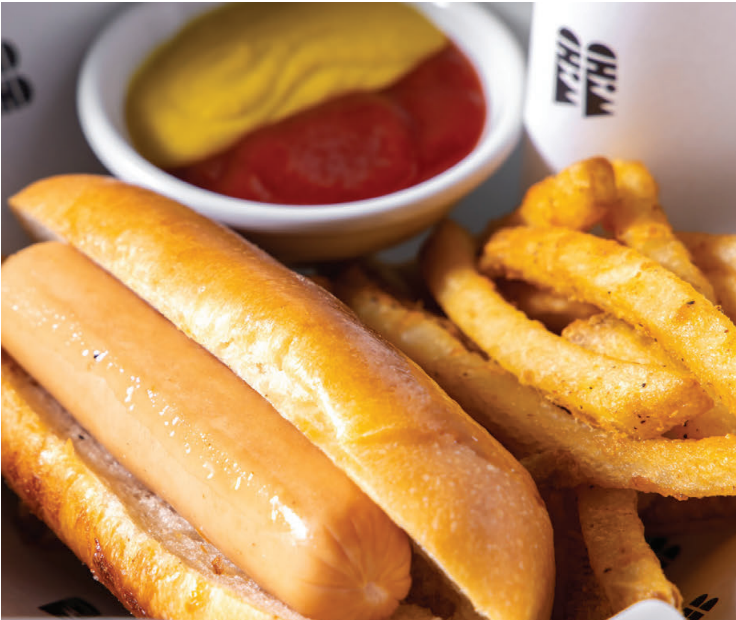
Chicken Hot Dog Hot Dog, Cajun Fries, Mustard & Ketchup 190฿