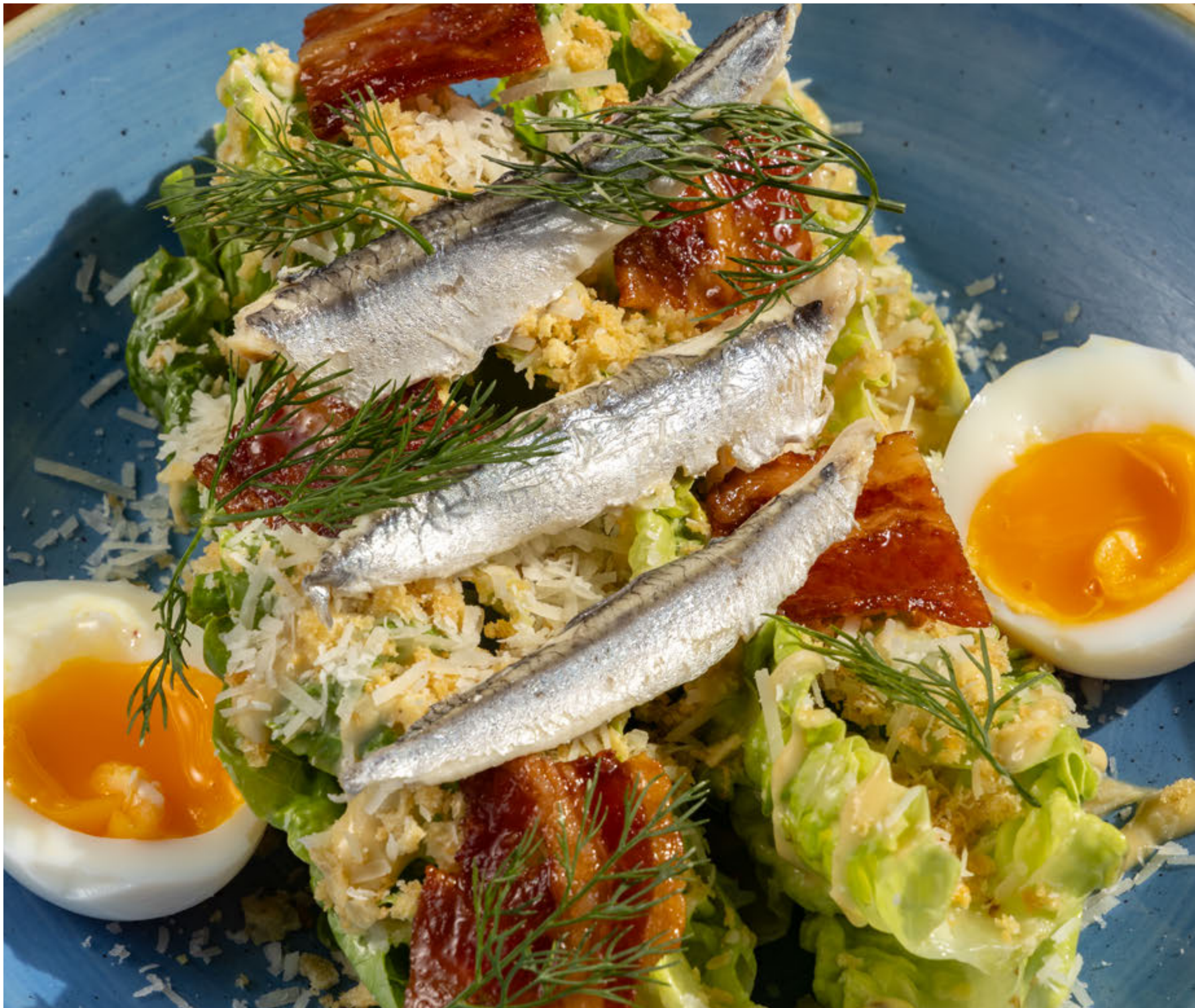
Caesar Salad Baby Romaine, Bacon, Parmesan Cheese, Breadcrumbs, 6min Egg 390฿