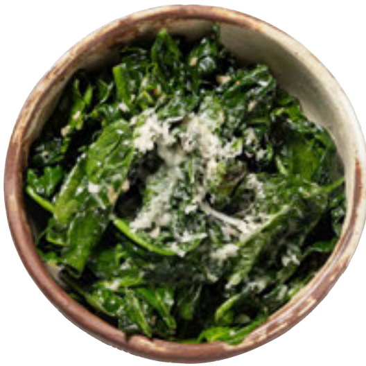
Sautéed Baby Spinach with Garlic & Parmesan Cheese