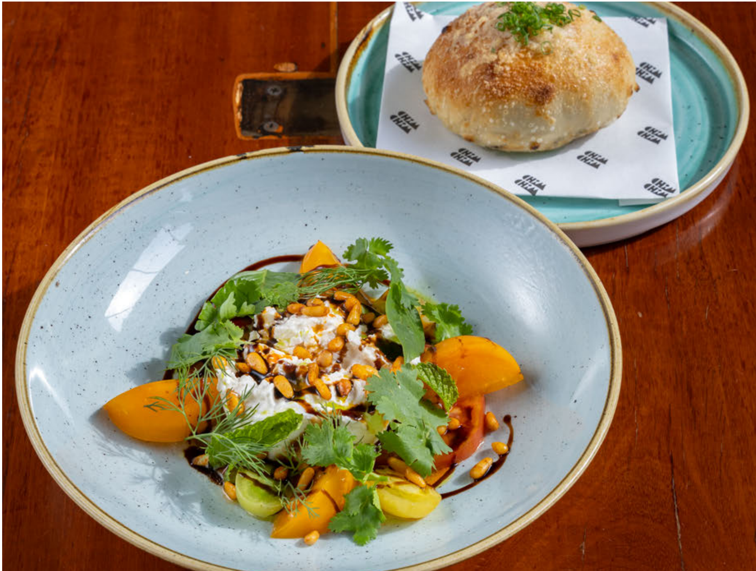
Heirloom Tomato & Burrata Salad Basil Oil, Balsamic Vinegar, Pine Nuts, Pizza Bread 650฿