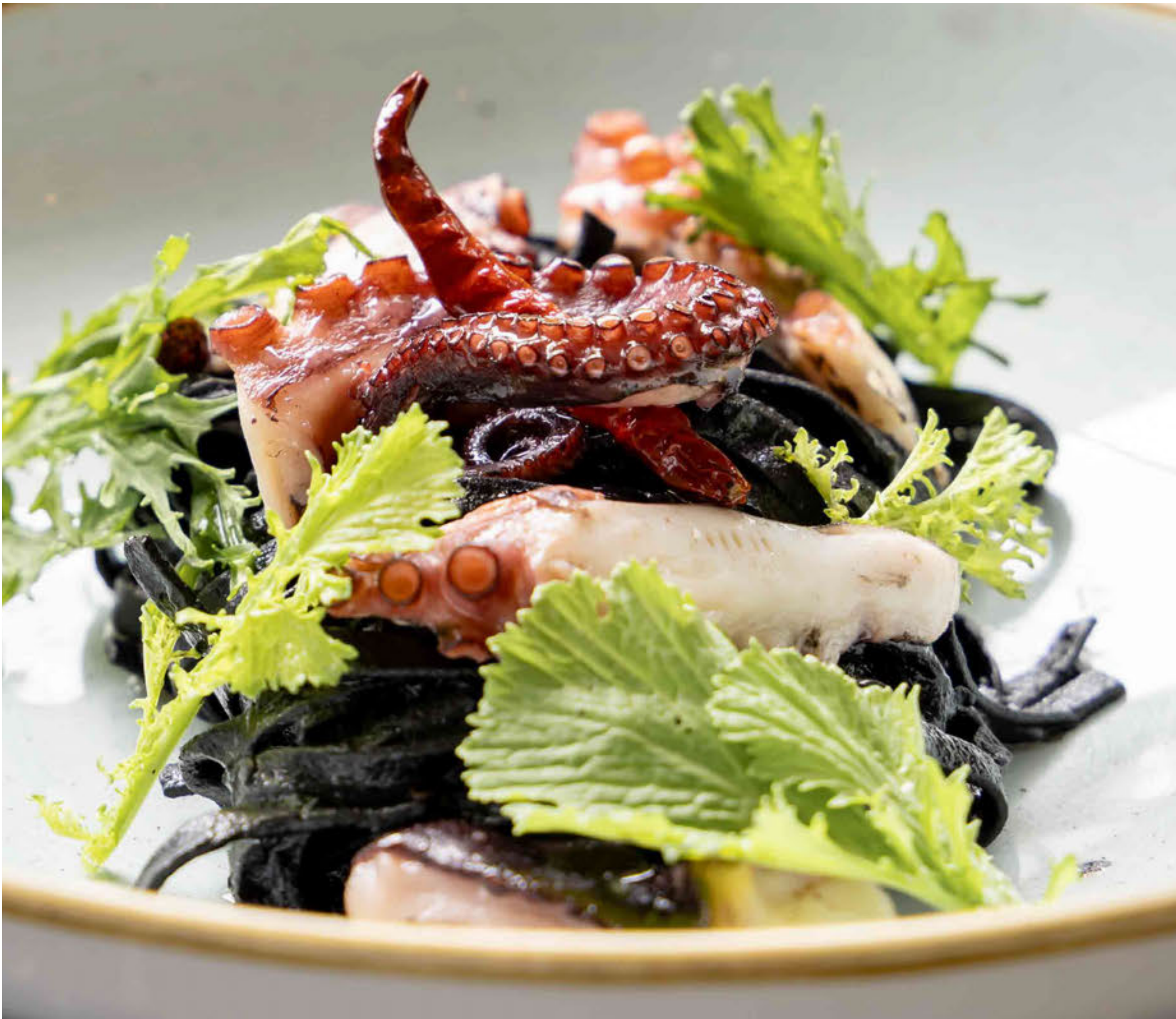
Ink & Octopus Homemade Squid Ink Linguine, Tataki Octopus, Chili Flakes, Tomato, Squid Ink, Dried Chili, Mustard Leaves 450฿