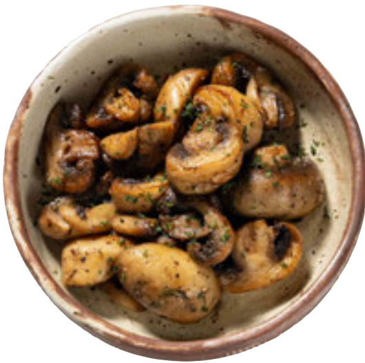
Sautéed Mushroom & Thyme