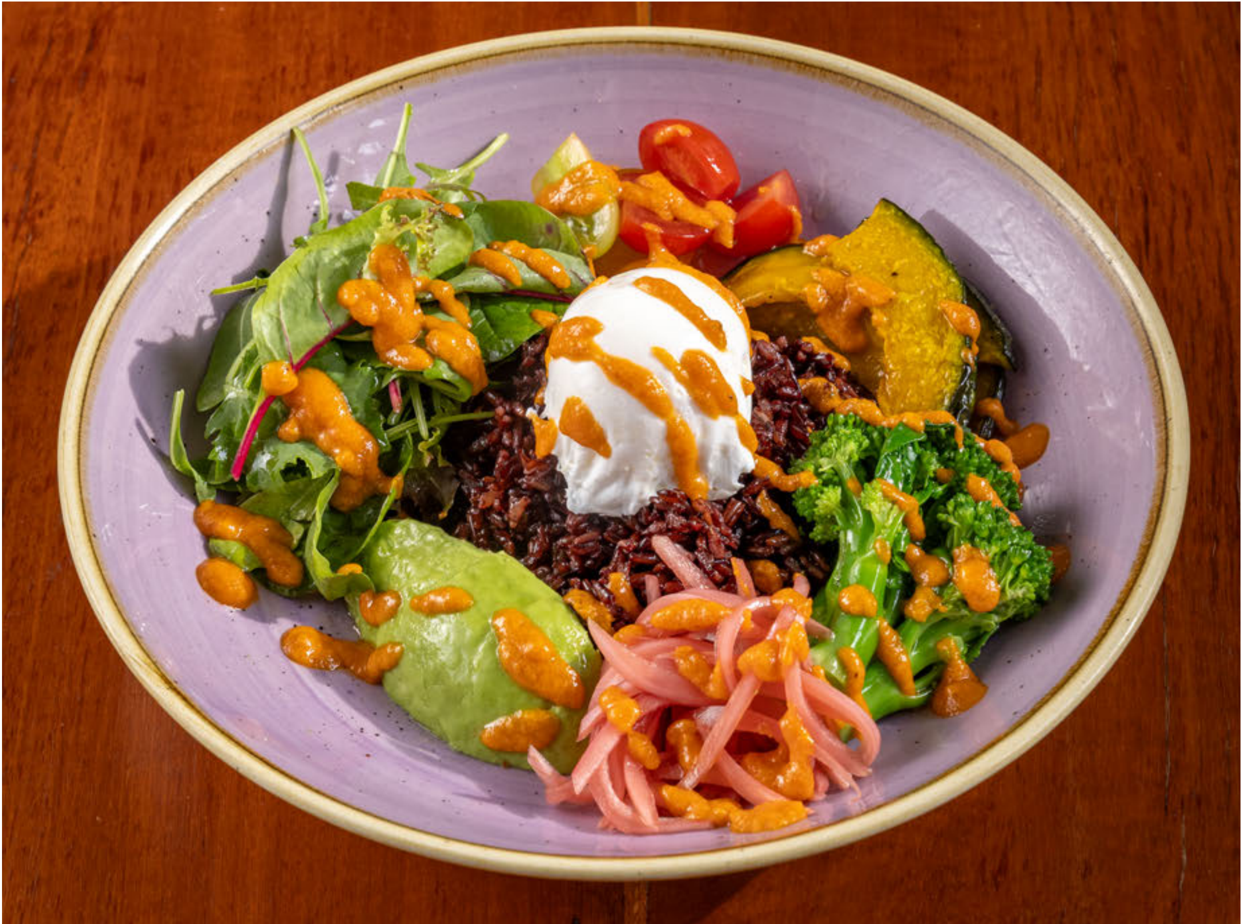
Chim Chim Power Bowl 2.0 Rice Berry, Japanese Squash, Broccolini, Cherry Tomato, Pickled Red Onion, Poached Egg, Mixed Greens, Tomato Vinaigrette 380฿