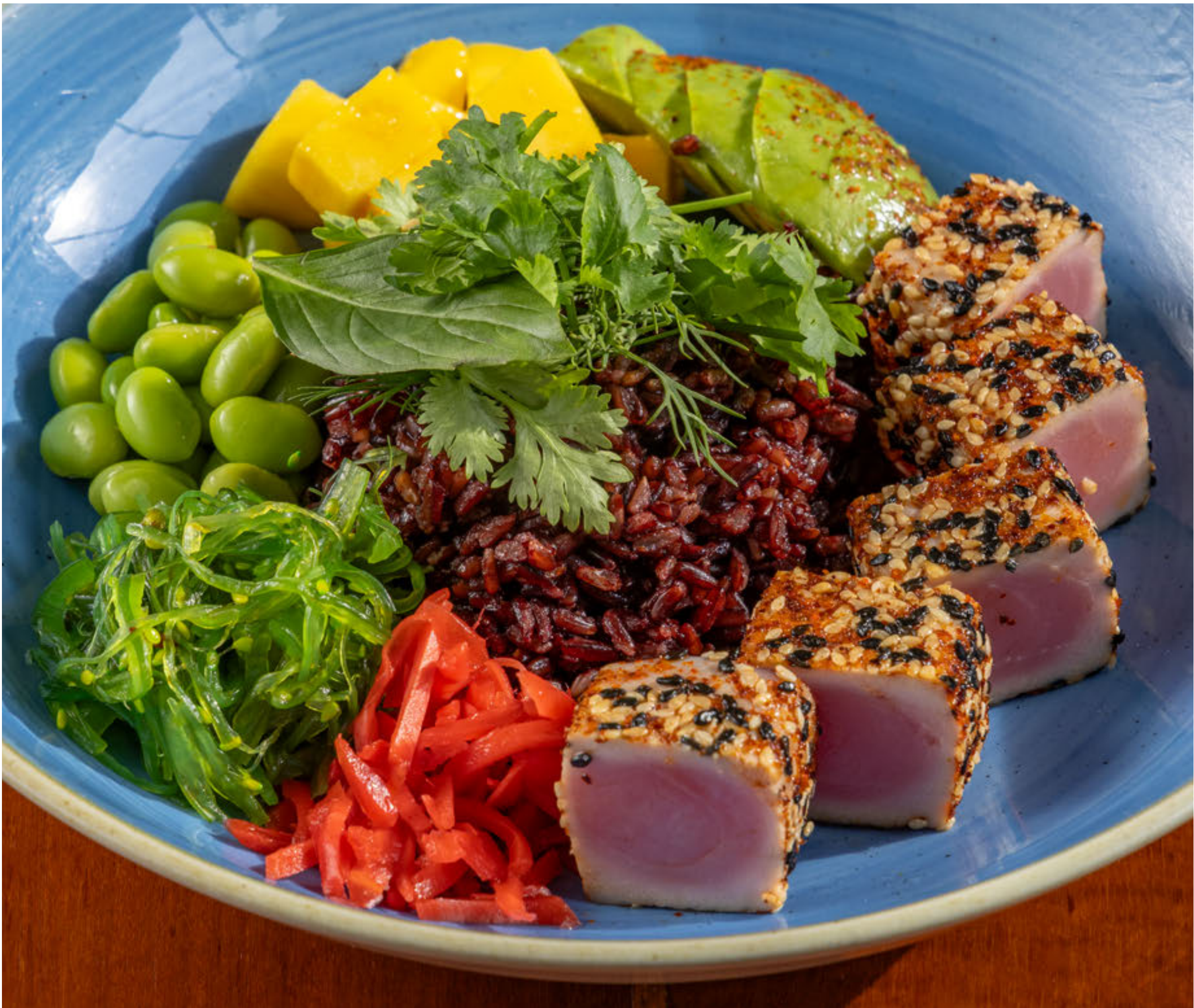
Poke Bowl Ahi Tuna Tataki, Rice Berry, Wakame Seaweed, Edamame, Mango, Avocado, Pickled Ginger, Ponzu Dressing 650฿