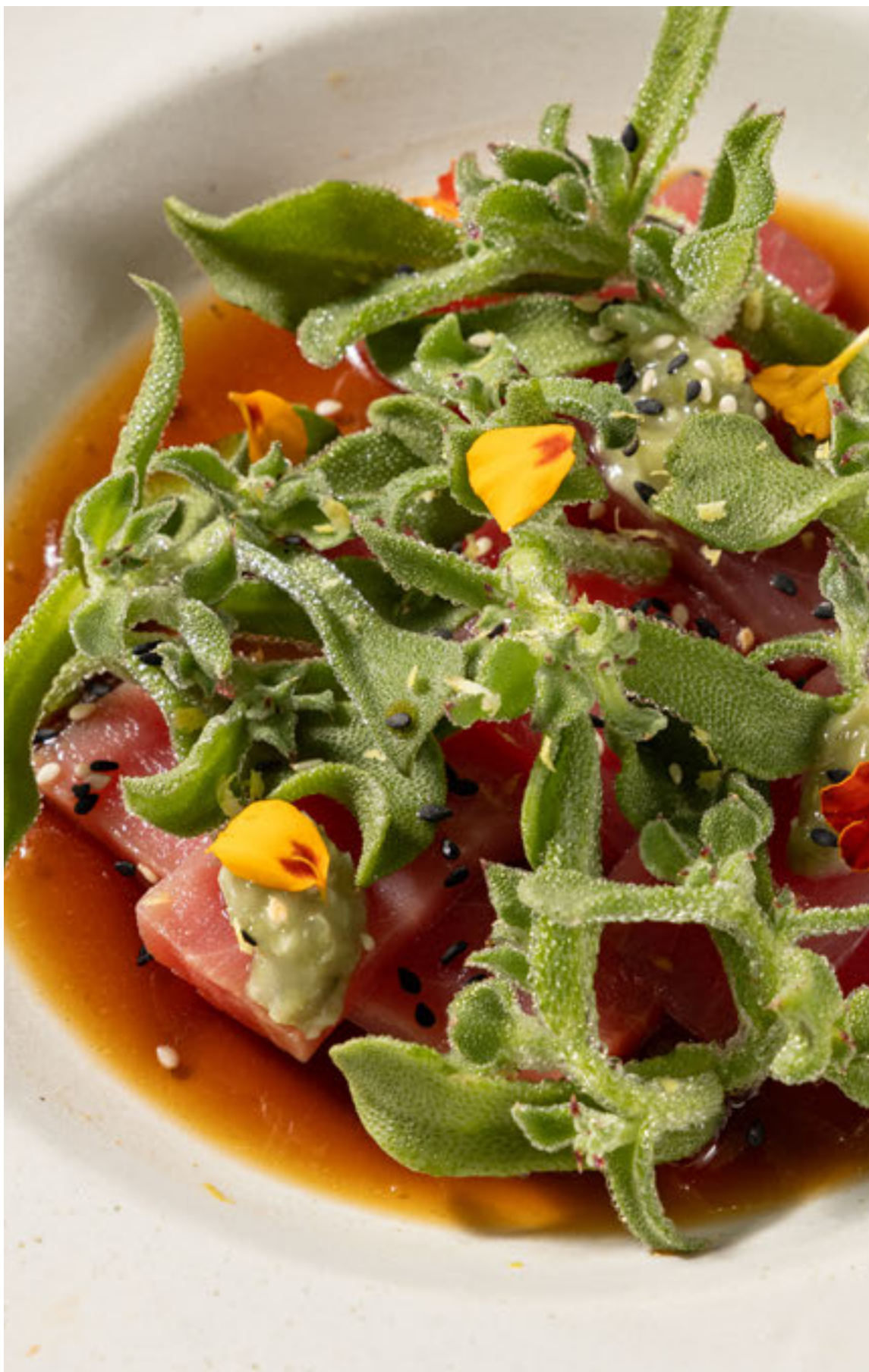
Akami Tuna Poke Akami Tuna, House-made Ponsu, Avocado Wasabi 390฿