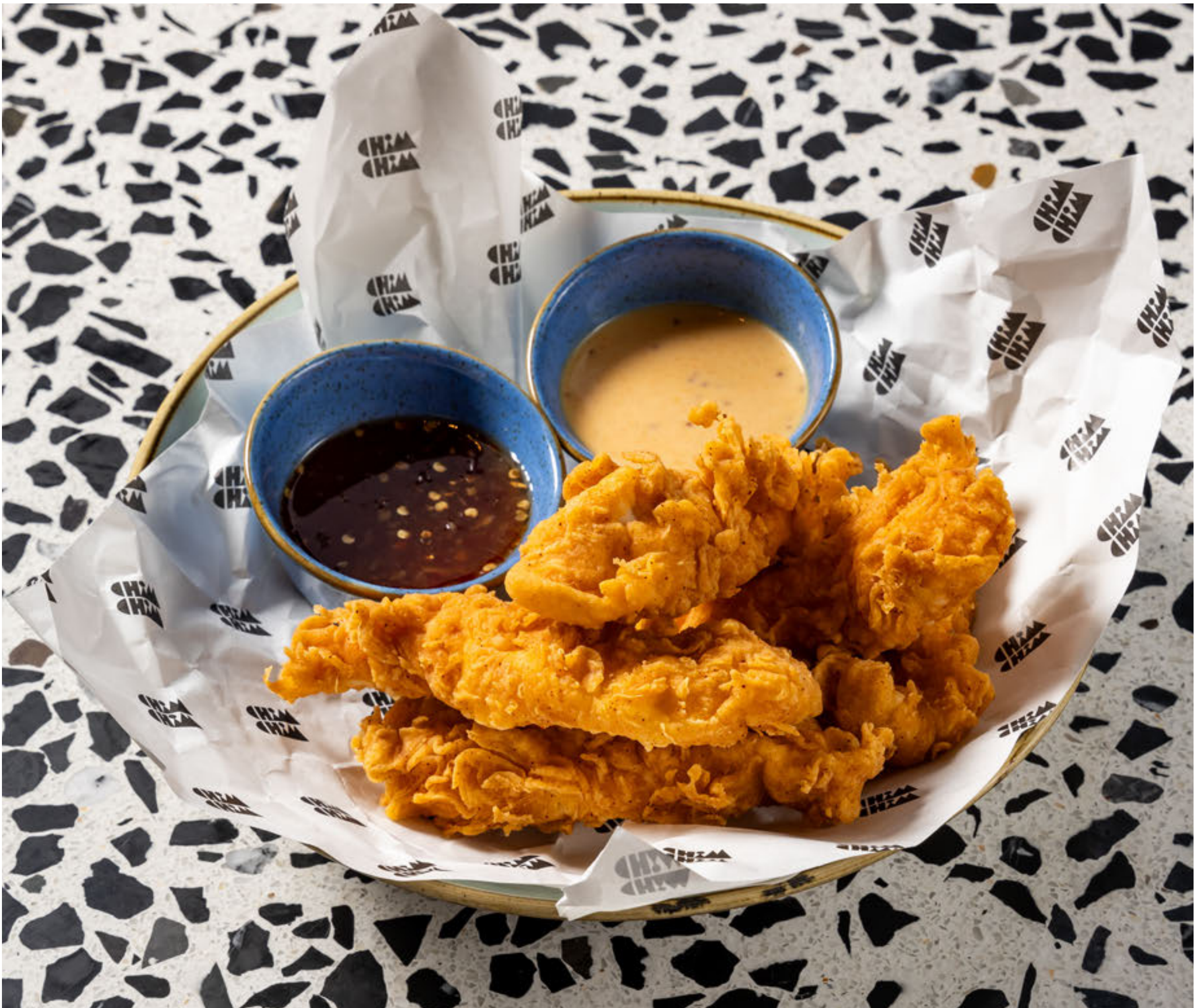
Fried Chicken Tenders Honey Mustard & Sweet Thai Chili Sauce 250฿