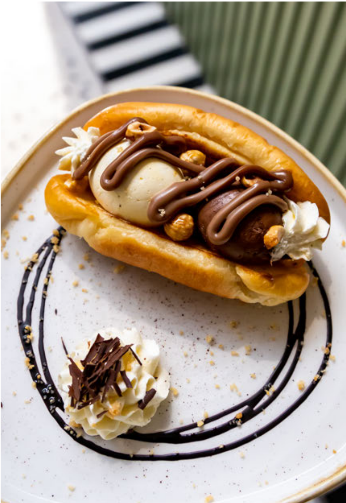
Ice Cream Bun Chocolate Ice Cream, Vanilla Ice Cream in Homemade Soft Bun, Praline Sauce, Sprinkled with Hazelnut Caramel, Shredded Chocolate 150฿